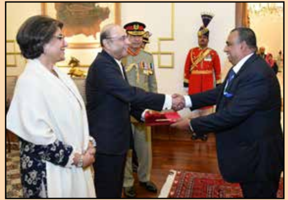
HIGH COMMISSIONER OF BANGLADESH