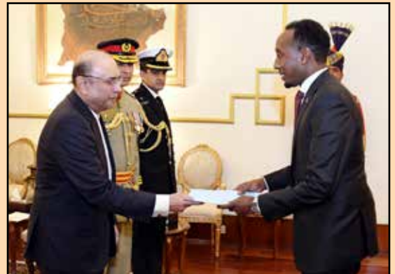
AMBASSADOR OF SOMALIA