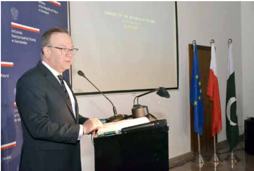
ISLAMABAD: Ambassador of Poland to Pakistan Maciej Pisarski addressing the year-end media briefing.

Says he was happy to report that our bilateral trade with Pakistan has been steadily increasing, with a significant jump from €456.74 million in 2018 to €861 million in 2023. This growth in trade is a reflection of the strengthening economic ties between our two countries