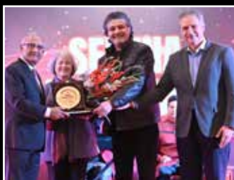
Serena Hotels Sarangi Season 7