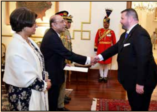
AMBASSADOR OF ROMANIA