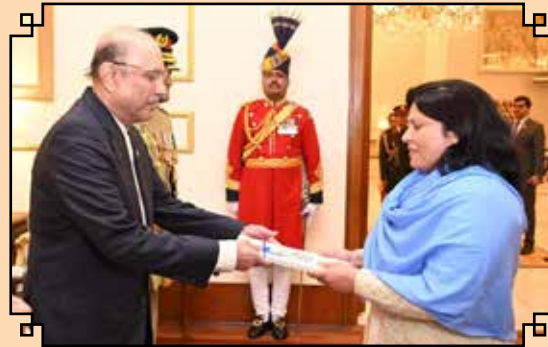
AMBASSADOR OF NEPAL