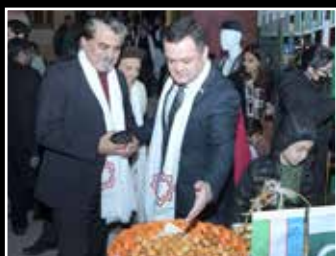
Silk Road Center opened in Capital