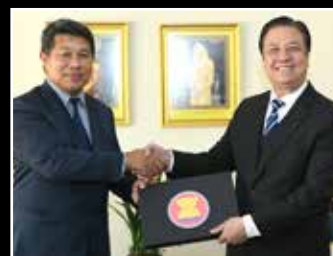
Myanmar gets ASEAN chair