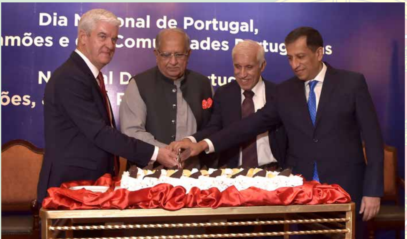
Ansar M Bhatti / DNA

Ambassador of Portugal Fredrico Silva says Portugal supported the recent election of Pakistan to a non-permanent seat in the United Nations Security Council