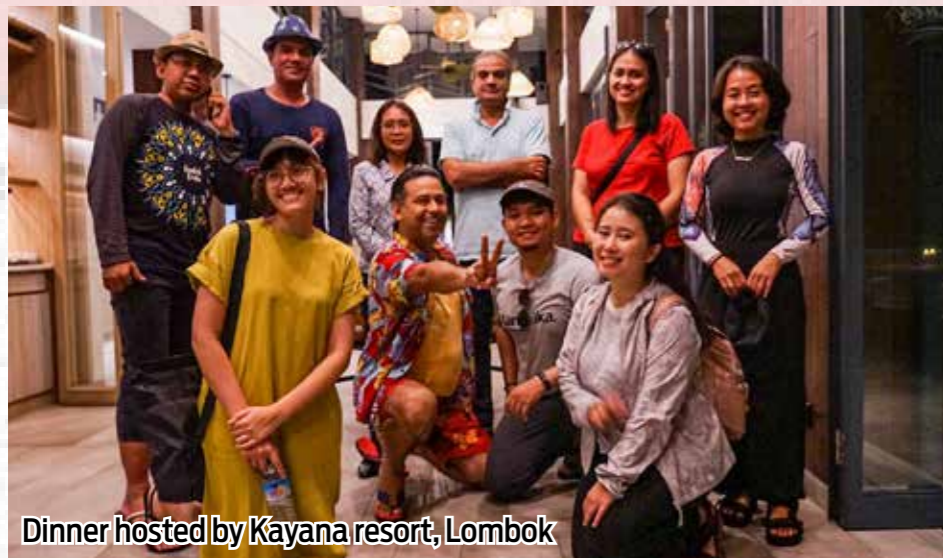
Dinner hosted by Kayana resort, Lombok