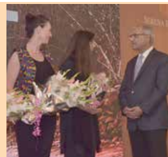
Canadian HC, Serena Hotels screen Minahil