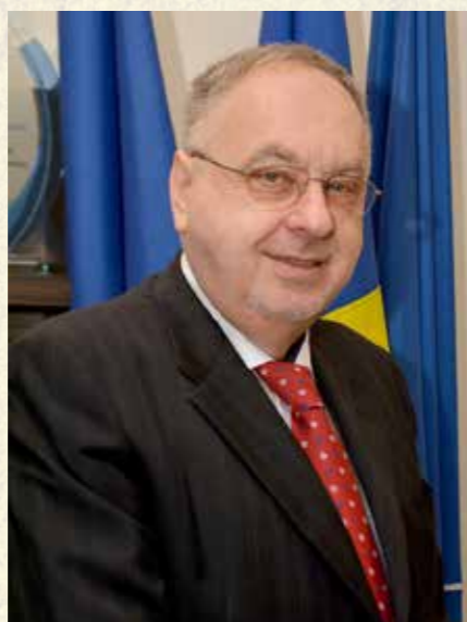
The smiling face heads to his eternal abode, leaving his near and dear ones in shock and pain