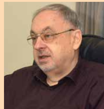
Romanian ambassador passes away