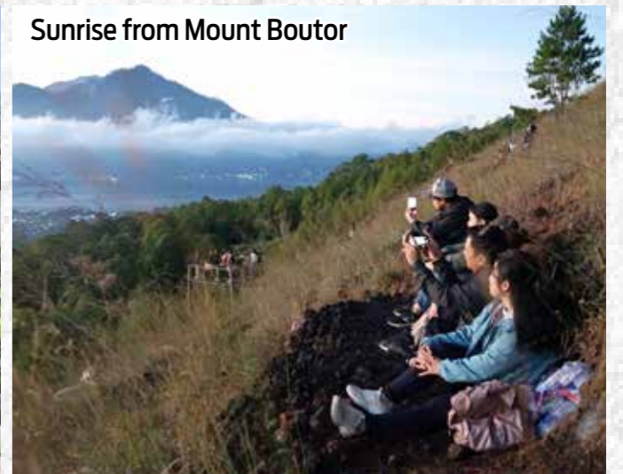
Sunrise from Mount Boutor

THE Mandalika Circuit is a motorsport race track located in the Mandalika Special Economic Zone on the island of Lombok, Indonesia. It is a part of the larger Mandalika Resort development, which aims to promote tourism in the region. The Pakistani media delegation visited the track. The management briefed the delegation about the working of the track. The Mandalika Circuit is designed to host various motorsport events, including For-