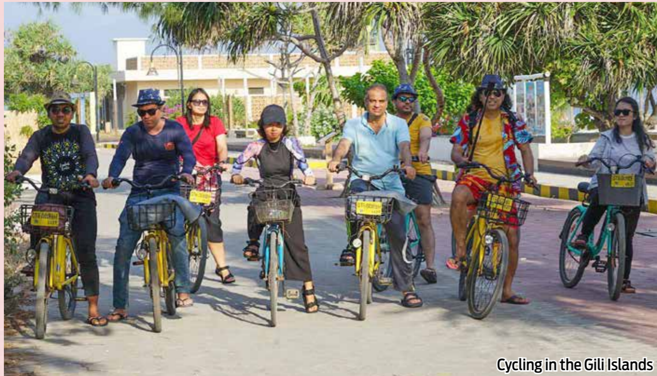
Cycling in the Gili Islands