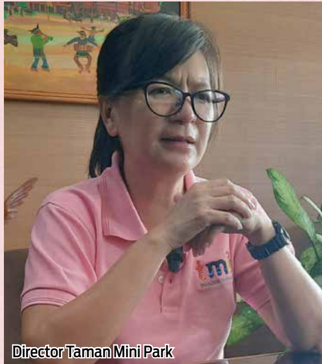
Director Taman Mini Park