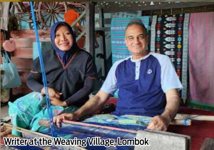
Writer at the Weaving Village, Lombok