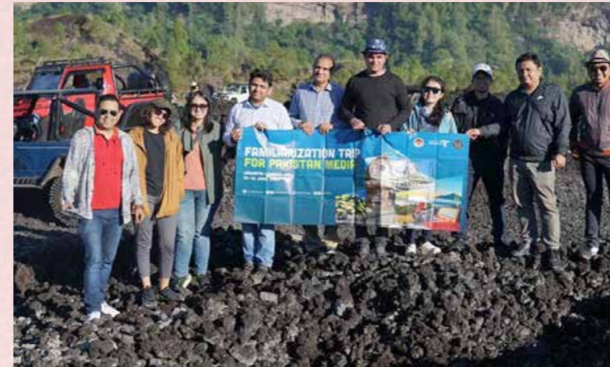
Visit to Black Lava and Black Sand spot

an eclectic mix of beats, setting the stage for an exhilarating night of dancing and celebration. The expertly crafted drinks flow freely, further enhancing the festive ambiance. H Club's lively and energetic environment, coupled with its electric atmosphere, ensures that every visit is a night to remember in the heart of Jakarta's nightlife scene.