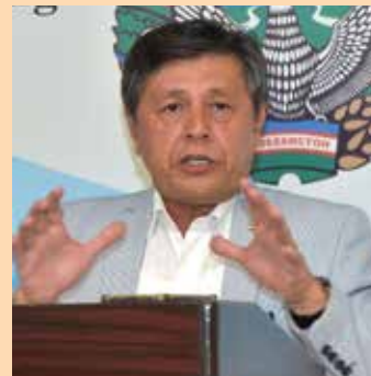
Uzbek embassy hosts Day of Journalism