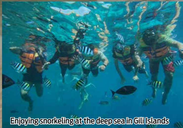
Enjoying snorkeling at the deep sea in Gili Islands