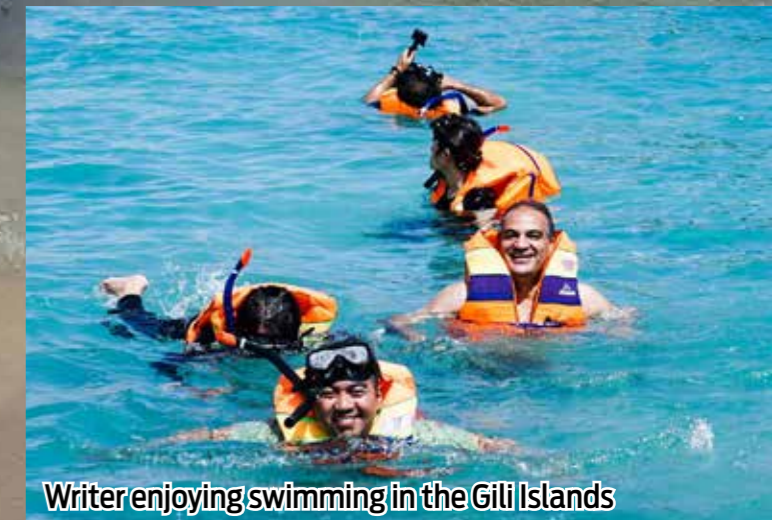
Writer enjoying swimming in the Gili Islands