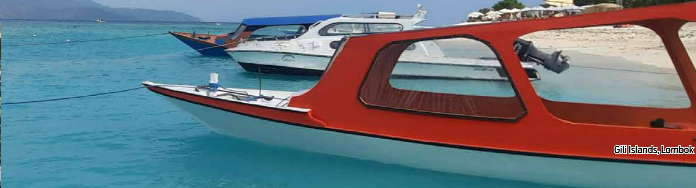
Gili Islands, Lombok