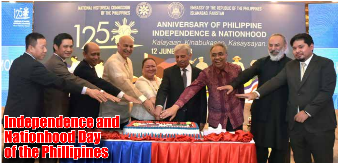
Independence and Nationhood Day of the Philippines