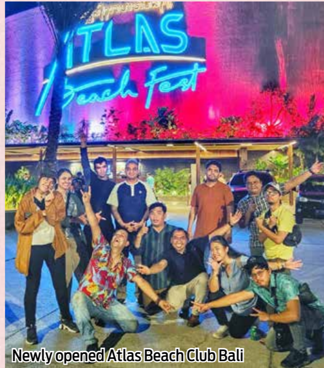
Newly opened Atlas Beach Club Bali

surroundings, she added. Taman Mini Jakarta remains committed to promoting sustainable tourism practices and preserving Indonesia's cultural heritage for future generations. Efforts are made to ensure the park's operations align with eco-friendly practices, and initiatives are in place to educate visitors about the importance of environmental conservation. It may be mentioned here that the Park covers approximately 150 hectares of land and features miniature replicas from all the provinces of Indonesia. Taman Mini is not just a tourist attraction but also serves as an educational center for visitors to learn about Indonesia's history, culture, and traditions. Because of its attractions and cultural heritage it has become a must-visit place. The Indonesia Ministry of Tourism and Creative Economy