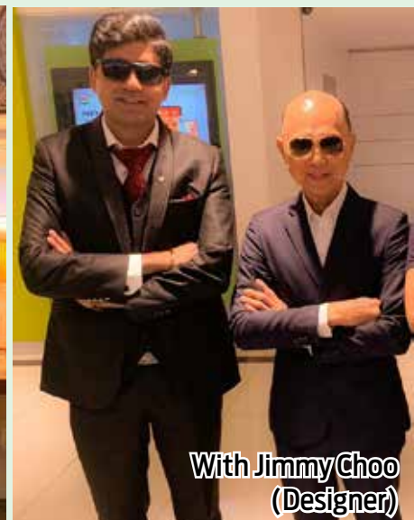
With Jimmy Choo (Designer)