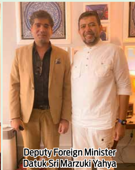
Deputy Foreign Minister Datuk Sri Marzuki Yahya