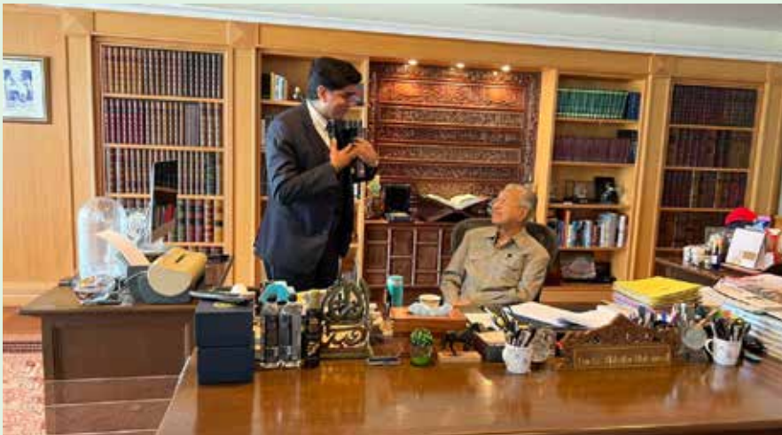
With Tun Mahathir

Panjtan Group of Companies started 15 years ago with first company was formed named Monzsat Services Sdn