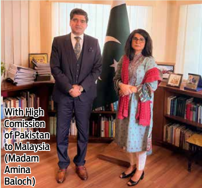
With High Commission of Pakistan to Malaysia (Madam Amina Baloch)