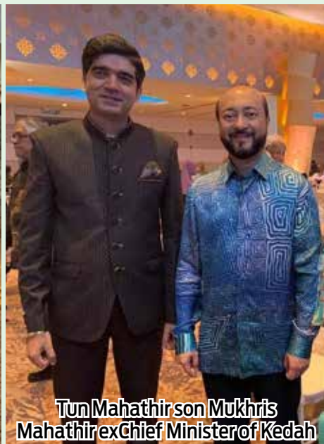
Tun Mahathir son Mukhris Mahathir ex Chief Minister of Kedah