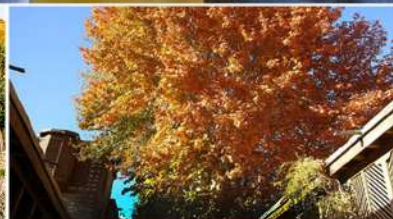
Serena Shigar Fort