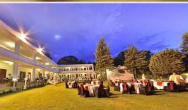
Swat Serena Hotel