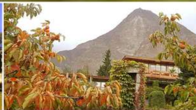
Gilgit Serena Hotel