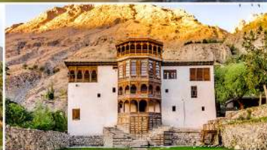
Serena Khaplu Palace