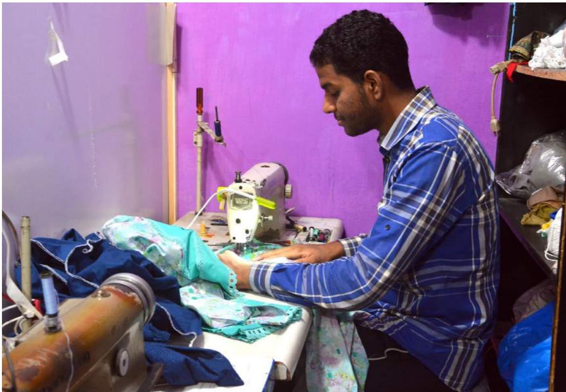
ISLAMABAD: A tailor is stitching women suits for the occasion of Eid ul Fitr. - DNA

(AWEC) Ms Palwasha Hassan said that the inclusion of four women in the Afghan government's peace negotiation team was evidence of the importance of women in Afghanistan. She added, though, that Taliban delegation did not have any women representatives in their delegation. Ms Hassan said that regional aspect of peacebuilding was as important as the regional dimension of the conflict. Therefore, she urged a strong networking among the people of regional countries believing in peace. She added that any form of solidarity shown by Pakistani women with the women of Afghanistan would go a long way in their struggle for safeguarding their rights.