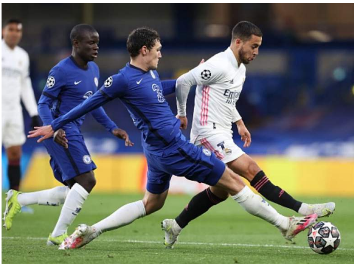
MANCHESTER: Real Madrid and Chelsea players vying during a semi-final match of Champions League.