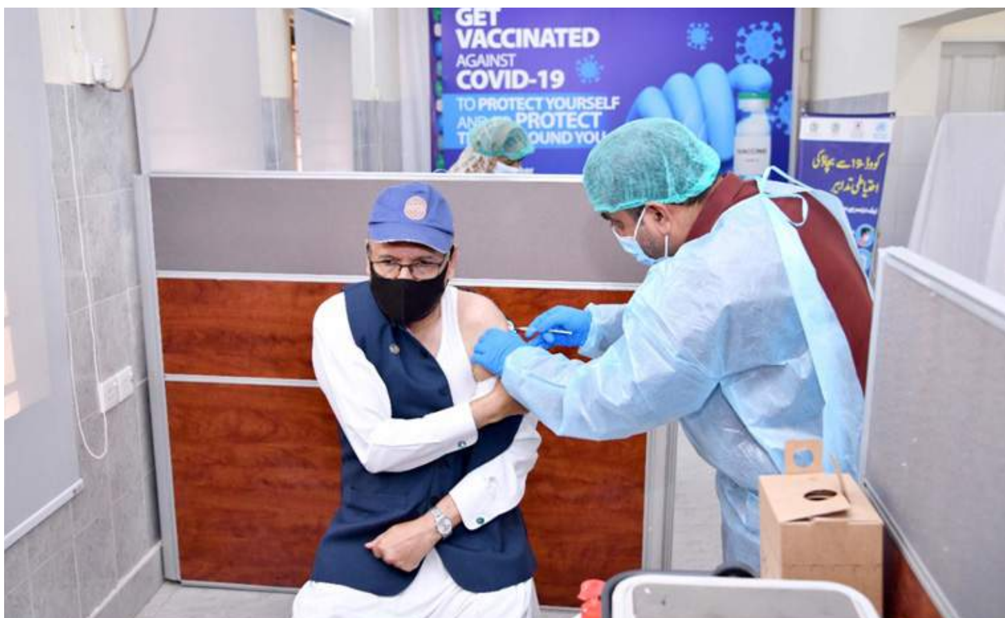
ISLAMABAD: President Dr. Arif Alvi being administered second dose of Covid-19 vaccine at vaccination centre.

LAHORE: 'Estranged' PTI leader Jahangir Khan Tareen has refuted rumours of a secret meeting with Prime Minister Imran Khan. Jahangir Tareen has rejected rumours doing rounds on social media that he had held a secret meeting with Prime Minister Imran Khan last month. He rejected these gossips saying there was no meat in them. A few days ago, while speaking to media after his appearance at a banking court in Lahore, Tareen said that his cronies held a meeting with PM Imran which went well. He said the PM assured his colleagues that he would look into the matter himself and assured them that justice would be done. Tareen said his case was business-related that had nothing to do with FIA.