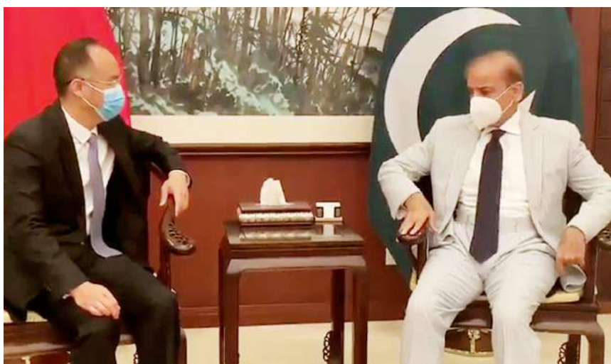
LAHORE: Ambassador of People's Republic of China Nong Rong in a meeting with PML President and Leader of the Opposition in the National Assembly Shahbaz Sharif.