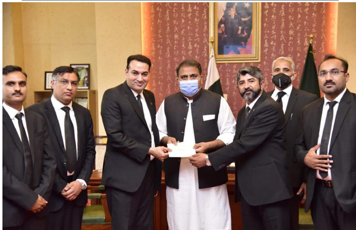
ISLAMABAD: Chaudhry Fawad Hussain, Federal Minister for Information and Broadcasting presenting a cheque of Rs. 3 Million to President, District Bar Association Jehlum.