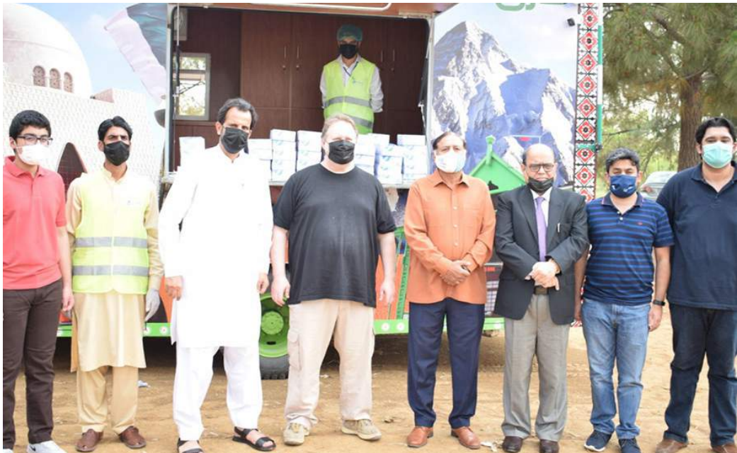
the distribution process and said that this Mari Mobile Dastarkhwan has become a symbol of hope for the deserving people of Islamabad, who are being served quality food on a daily basis.