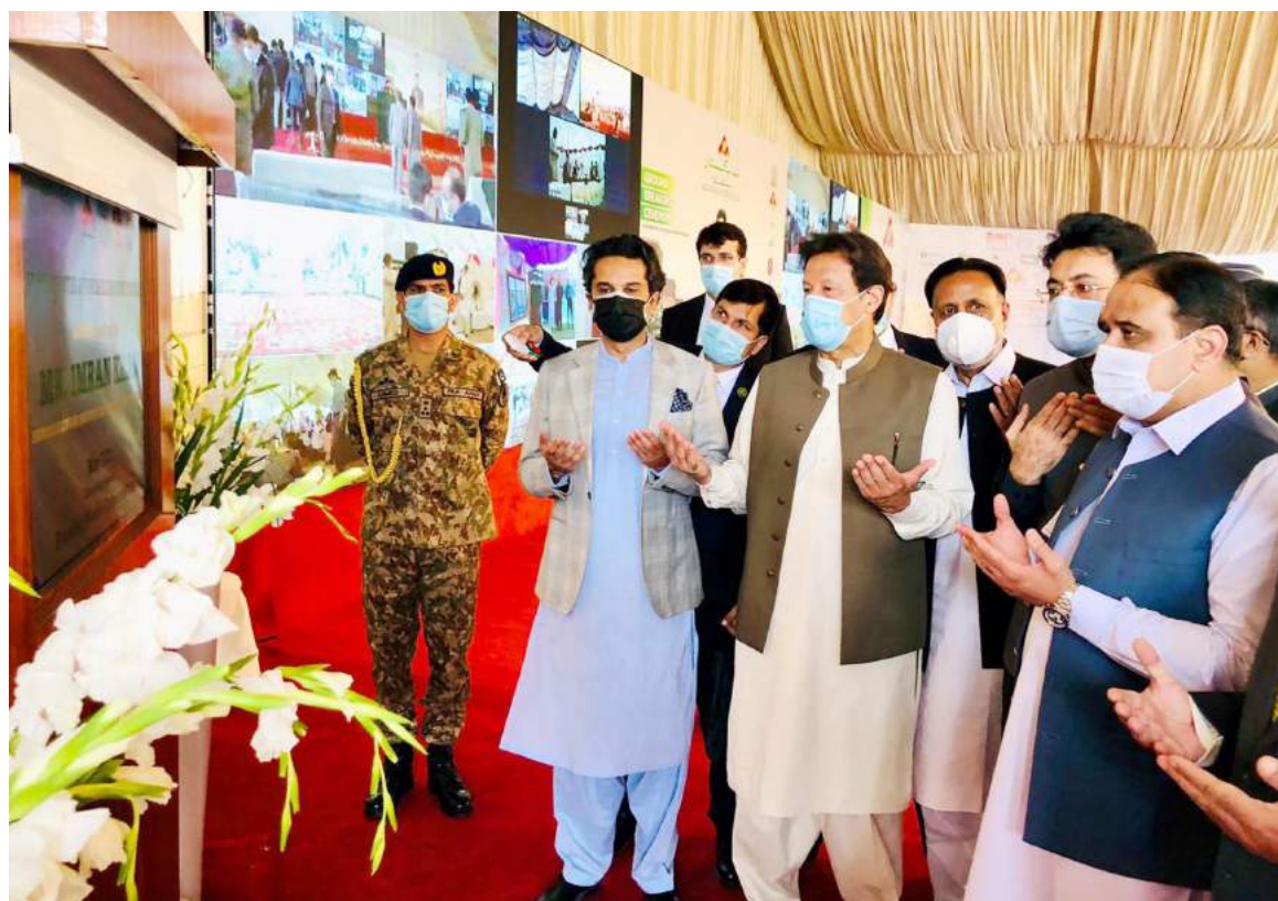
LAHORE: Prime Minister Imran Khan offering Dua after groundbreaking of "Peri-Urban Low Cost Housing Schemes".