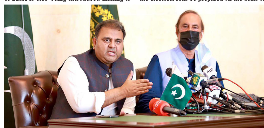
ISLAMABAD: Federal Minister for Information and Broadcasting Fawad Chaudhry along with Adviser on Parliamentary Affairs to Prime Minister, Dr Babar Awan addressing press conference at Pak China Center.

Therefore, it has been decided to bring an amendment in section 202 under which the political parties having representation of ten thousand members will be able to get themselves registered. A new section of 213A is also being introduced making it