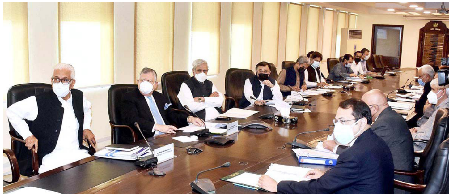
ISLAMABAD: Federal Minister for Finance and Revenue, Mr. Shaukat Tarin, Chairing the meeting of the National Price Monitoring Committee (NPMC) at the Finance Division to review the price trend of essential items.