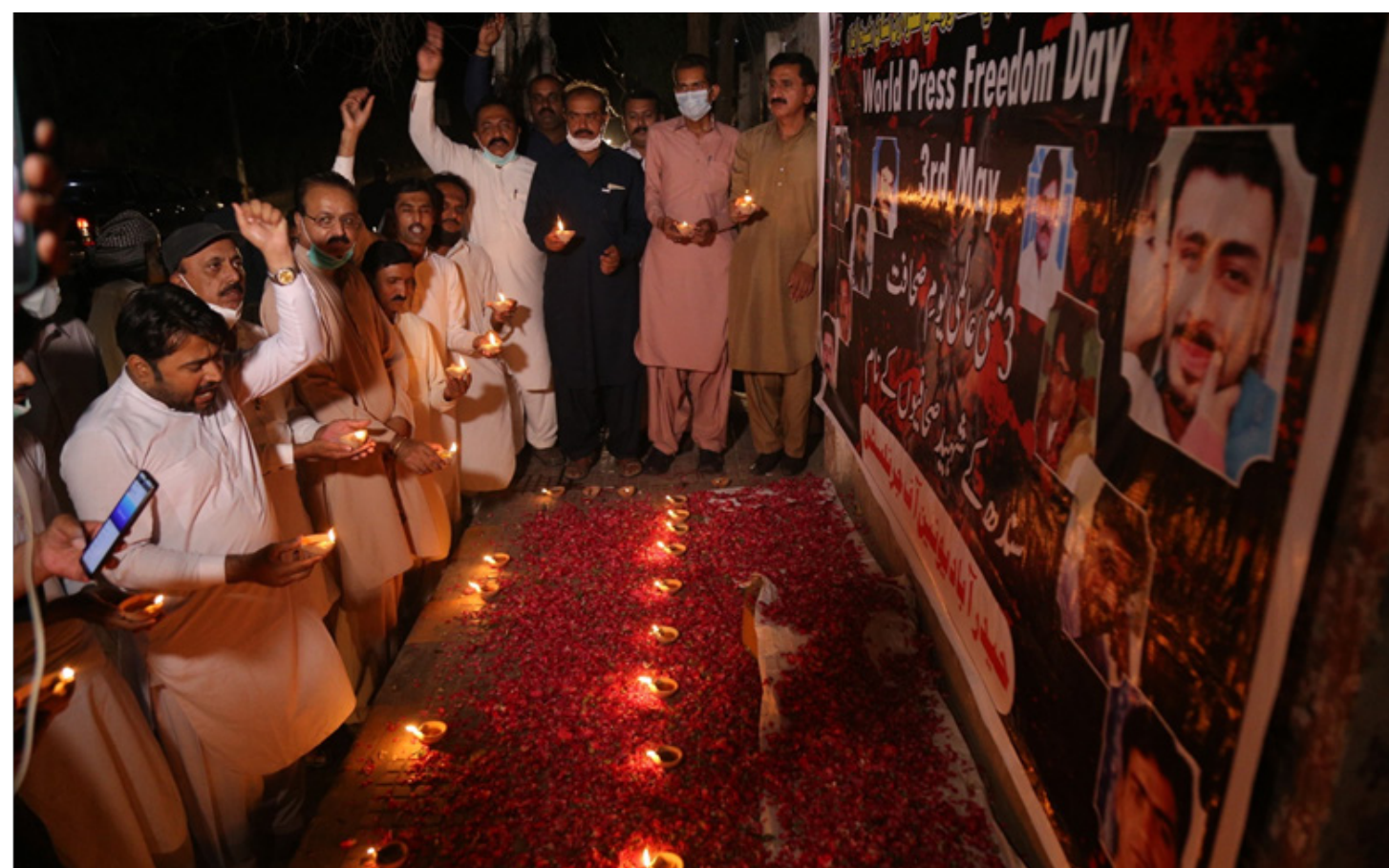
HYDERABAD: Members of Hyderabad Union of Journalists (HUIJ) burns candles in connection of world Journalism day outside Hyderabad press club.

The commissioner directed the DC Khushab to ensure implementation of the corona SOPs, issued by the government and ensure safe delivery of ballot boxes and other election materials at the polling booths. — APP