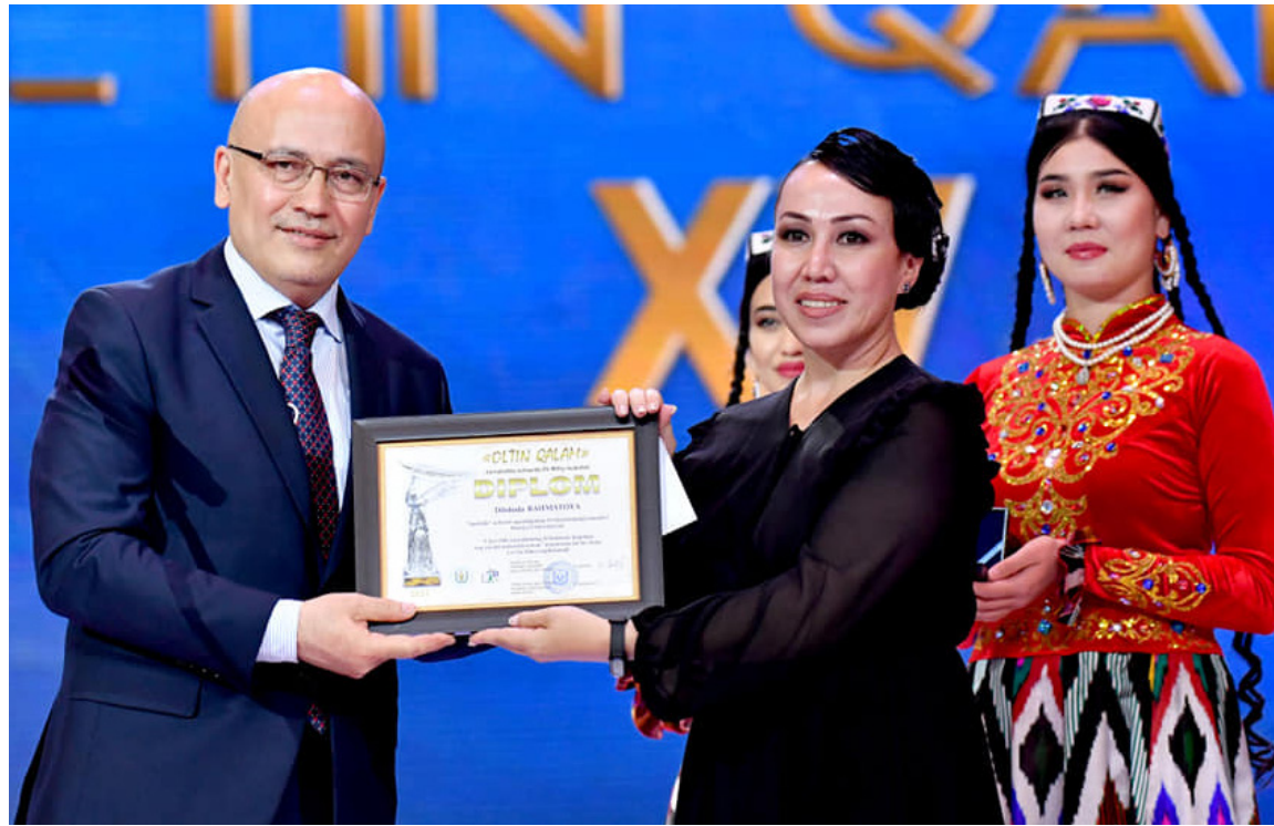
TASHKENT: Deputy Foreign Minister of Uzbekistan Furqat Sidikov giving awards to the winners of the XV International Competition for "OLTIN QALAM" ("Golden Pen") National Prize at the magnificent Turkiston Palace. - DNA

2019 describing Biden as a "rabid dog" who "must be beaten to death with a stick". A welcoming dinner for the Group of Seven foreign ministers will address both North Korea and Iran. Both the United States and Britain have played down reports that Iran will release their respective nationals from captivity as diplomacy steps up. Britain said that talks were still continuing and denounced the "torture" of dual national Nazanin Zaghari-Ratcliffe after Iranian state television said that she could be released from years of detention after London settles an old debt. After the G7, Blinken will head Wednesday to Ukraine in a show of support after Russia last month deployed but then pulled back some 100,000 troops along its border and in annexed Crimea.