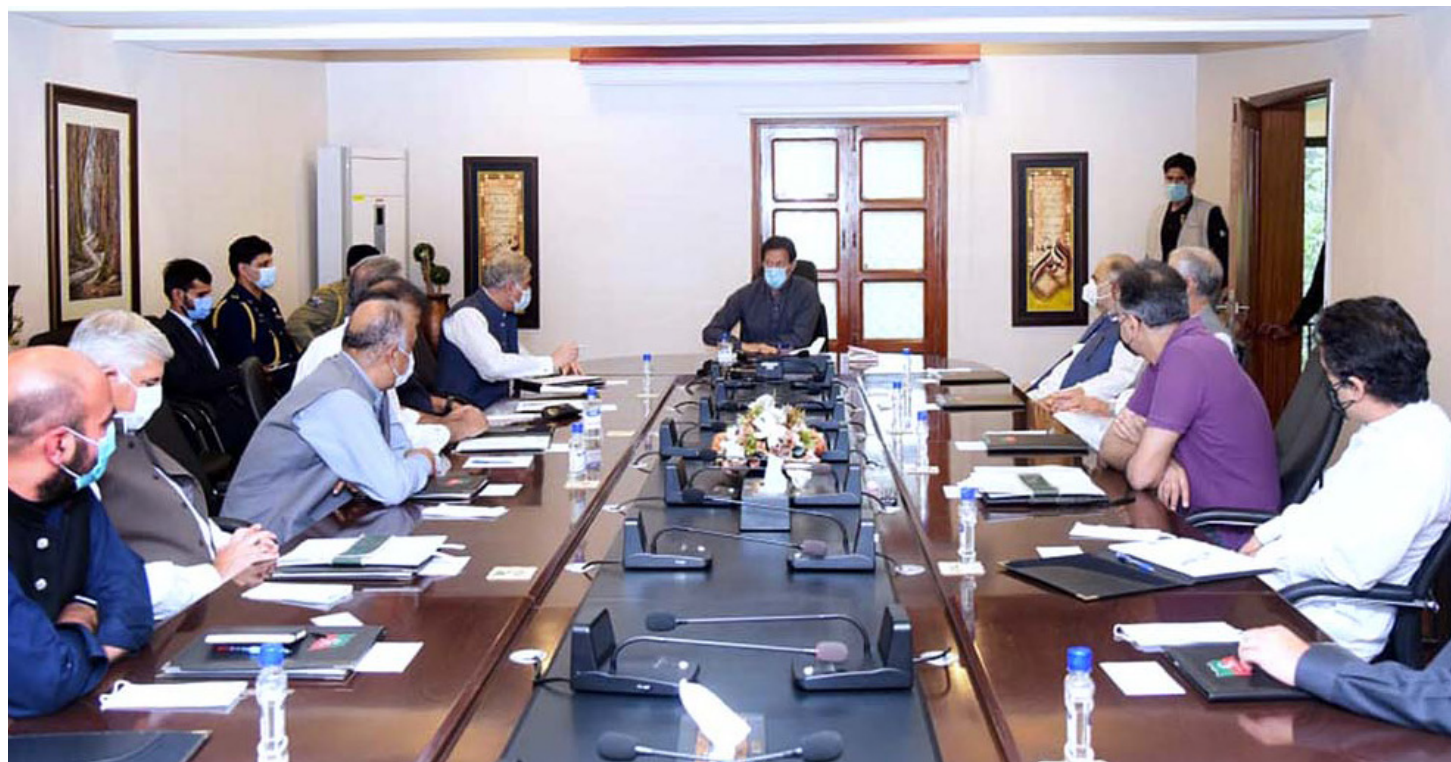
ISLAMABAD: Prime Minister Imran Khan chairs a meeting to discuss country's overall Economic condition and forthcoming budget.