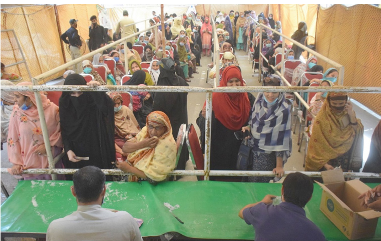
LAHORE: People queue to get sugar in Lahore. Sugar is not easily available despite govt claims.