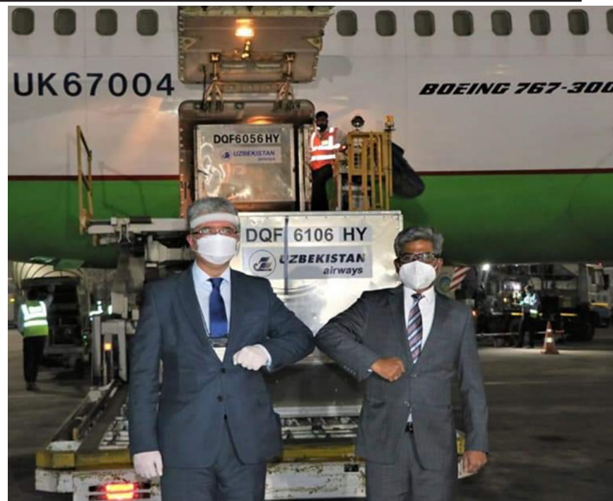
NEW DELHI: A plane from Tashkent has landed in Delhi with humanitarian aid which consists of oxygen concentrators & sought after medicines. - DNA

dom, Freedom." Exactly a month previously on April 1, around 2,000 people had gathered in the Bois de la Cambre and several people were hurt, along with officers and horses, in clashes when the police intervened. Belgium is under its second national lockdown as a coronavirus prevention measure and bars and restaurants have been shut since late October. But a vaccination drive is picking up speed and outdoor dining and drinking is due to resume on May 8. - APP