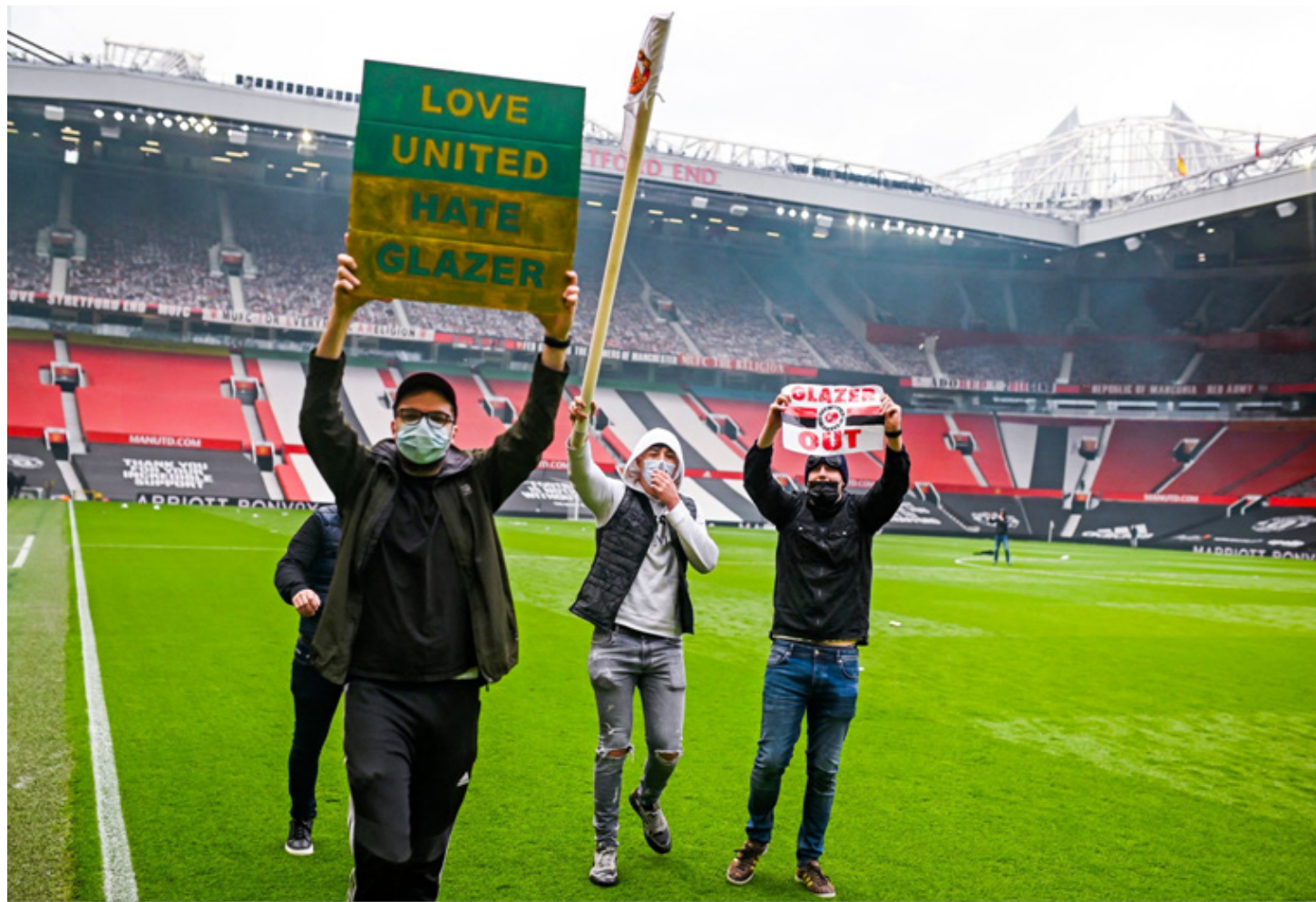
MANCHESTER: Manchester United fans on Sunday stormed the Old Trafford stadium protesting against the club ownership.