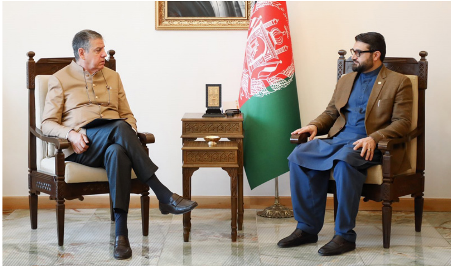
KABUL: Afghan NSA met NATO Senior Civilian Representative Ambassador Stefano Pontecorvo and discussed joint efforts to effect an orderly transition. "The sides discussed practical steps to deepen Afghan-NATO co-op in the next chapter of bilateral relations." - DNA

role in pushing forward China-EU relations, Wang added. On the Cyprus issue, Wang noted that the fact that the informal 5+1 meeting on the Cyprus issue was held on schedule is a positive signal, and China will continue to support all parties in pushing for a comprehensive, just and lasting settlement of the issue on the precondition of strictly abiding by relevant United Nations resolutions and fully respecting the will of the Cypriot people.