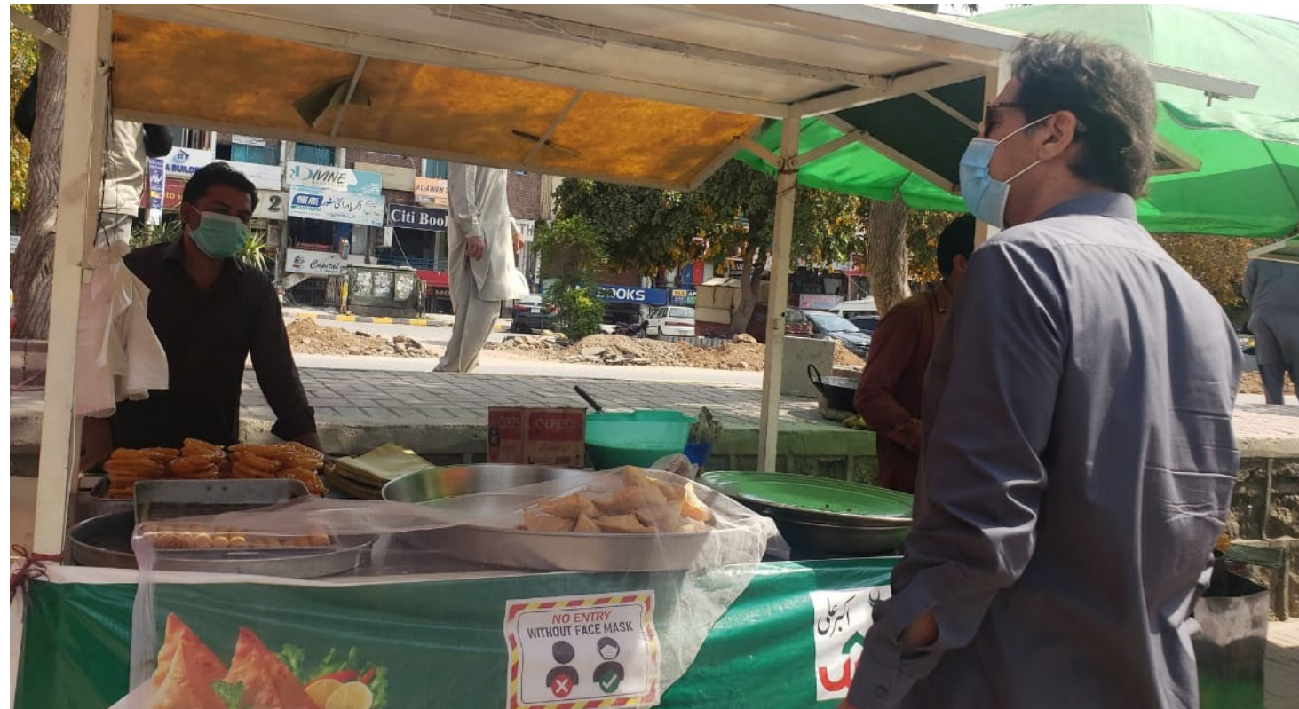
ISLAMABAD: PM Imran Khan visiting a stall in G 11 Markaz, during his surprise visit to the city, on Sunday.

LAKKI MARWAT: A Lakki Marwat woman gave birth to quintuplets at Lady Reading Hospital in Peshawar on Sunday. According to doctors, the mother and her five children were healthy. Lady Reading Hospital spokesman said the family belonged to Lakki Marwat and the woman had been brought into the Gynaecology Ward of the hospital. He said that she gave birth to five children and all are boys. The spokesman further said the hospital's gynae unit is providing health facility 24 hours a day.