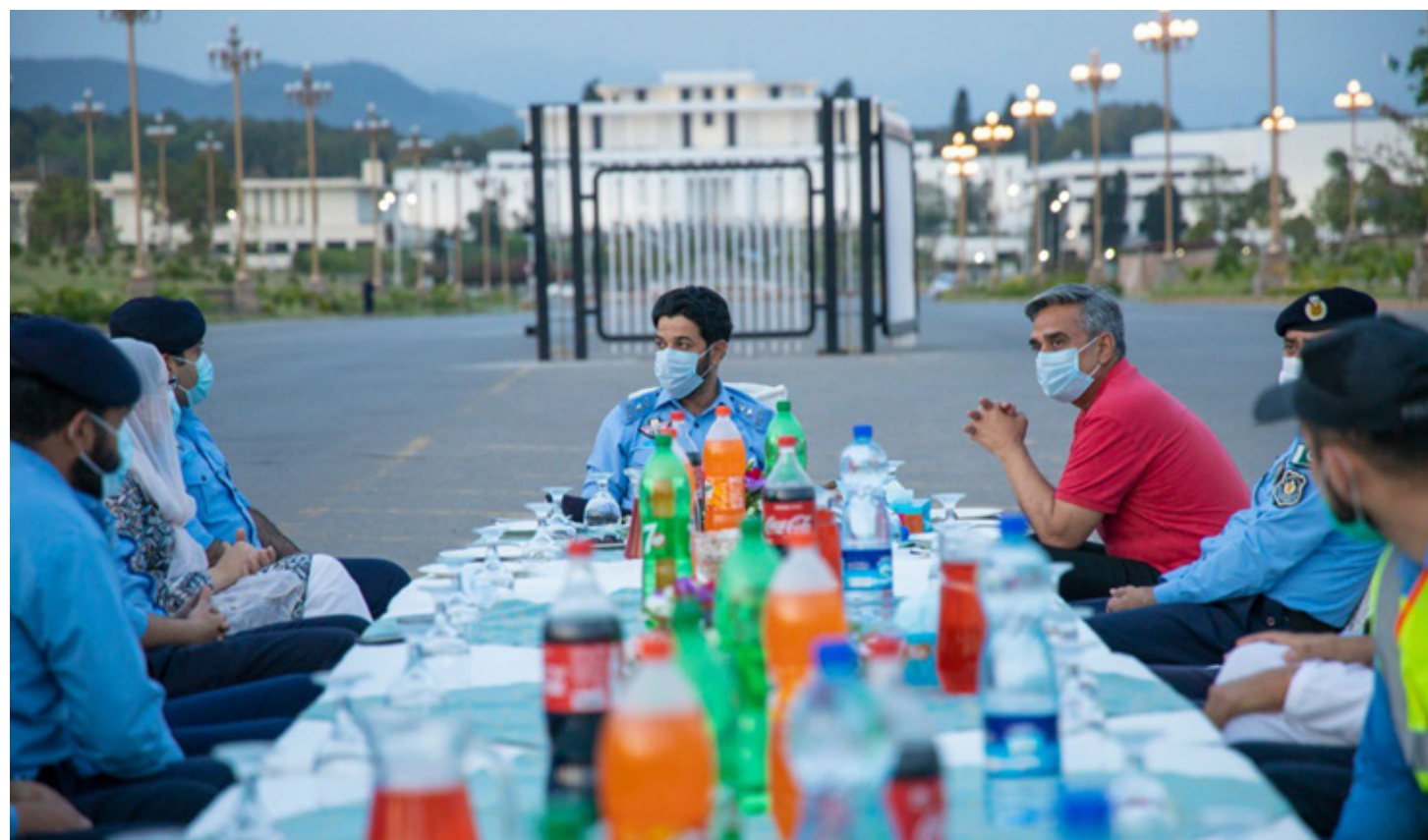
ISLAMABAD: Police officials breaking fast during their duty, in front of the Parliament House.