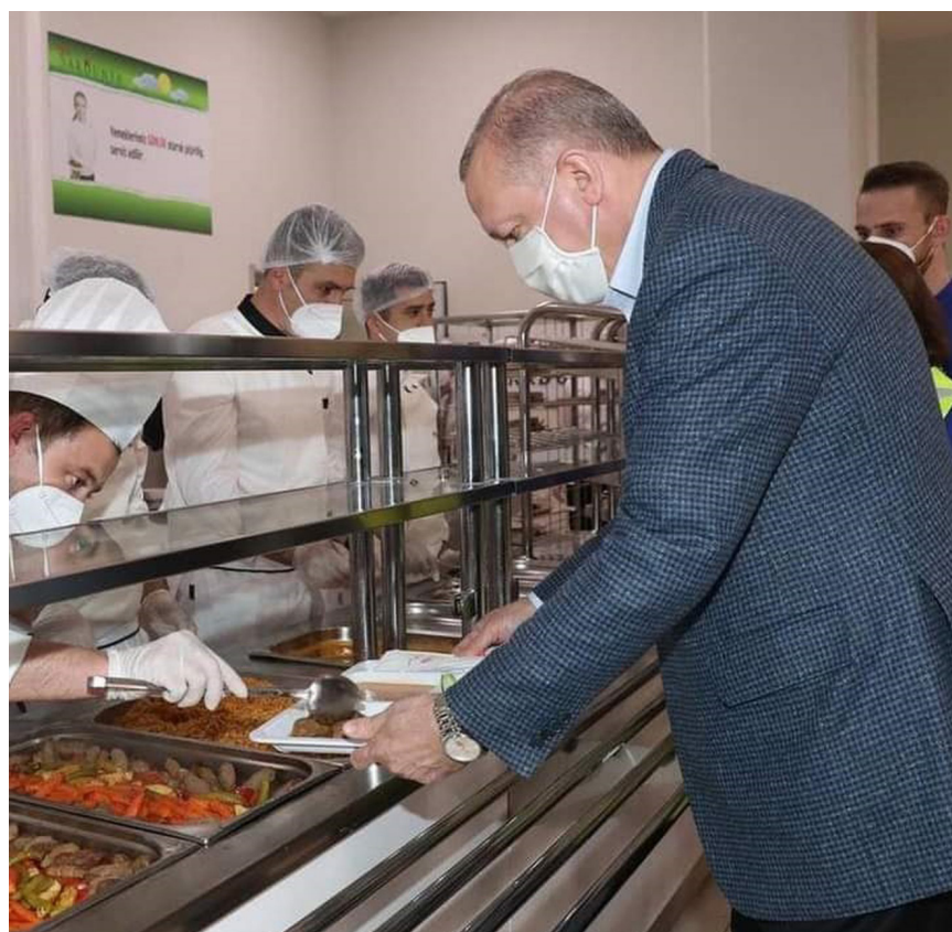
ANKARA: President of Turkey Recep Tayyip Erodgam broke his fast with labourers at a factory, on the occasion of the Labour Day.