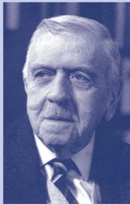
ORLANDOS: THE GUARDIAN ANGELS OF ANCIENT MONUMENTS