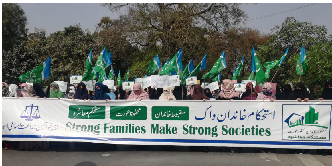
LAHORE: A large number of women participating in 'women walk' on the eve of International Women's Day organized by Jamaat e Islami women wing.