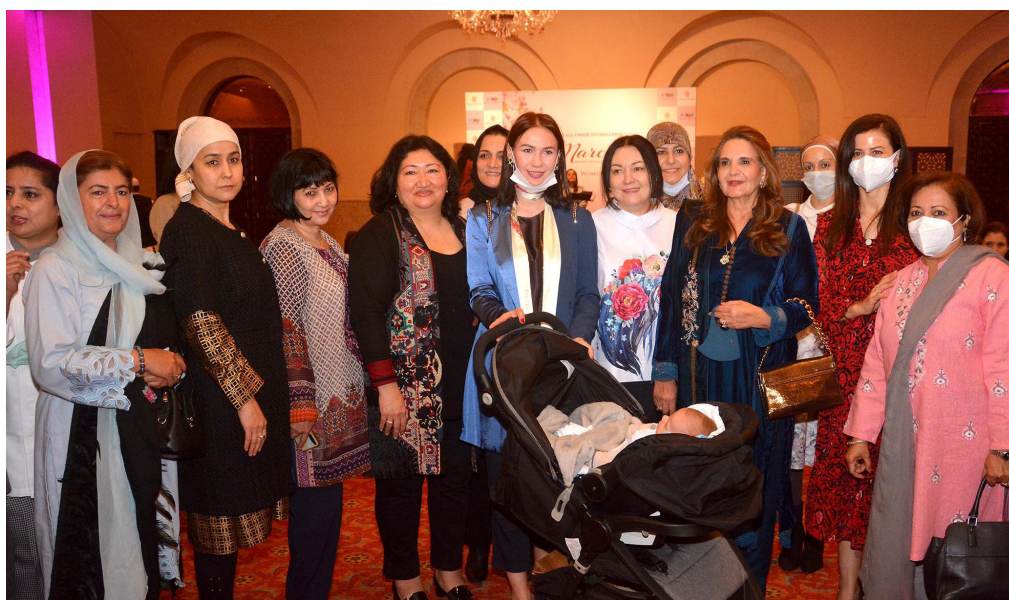
ISLAMABAD: First Lady Mrs. Samina Alvi posing for a picture with wives of diplomats and other ladies on the occasion of International Women Day celebrations, at Islamabad Serena Hotel.