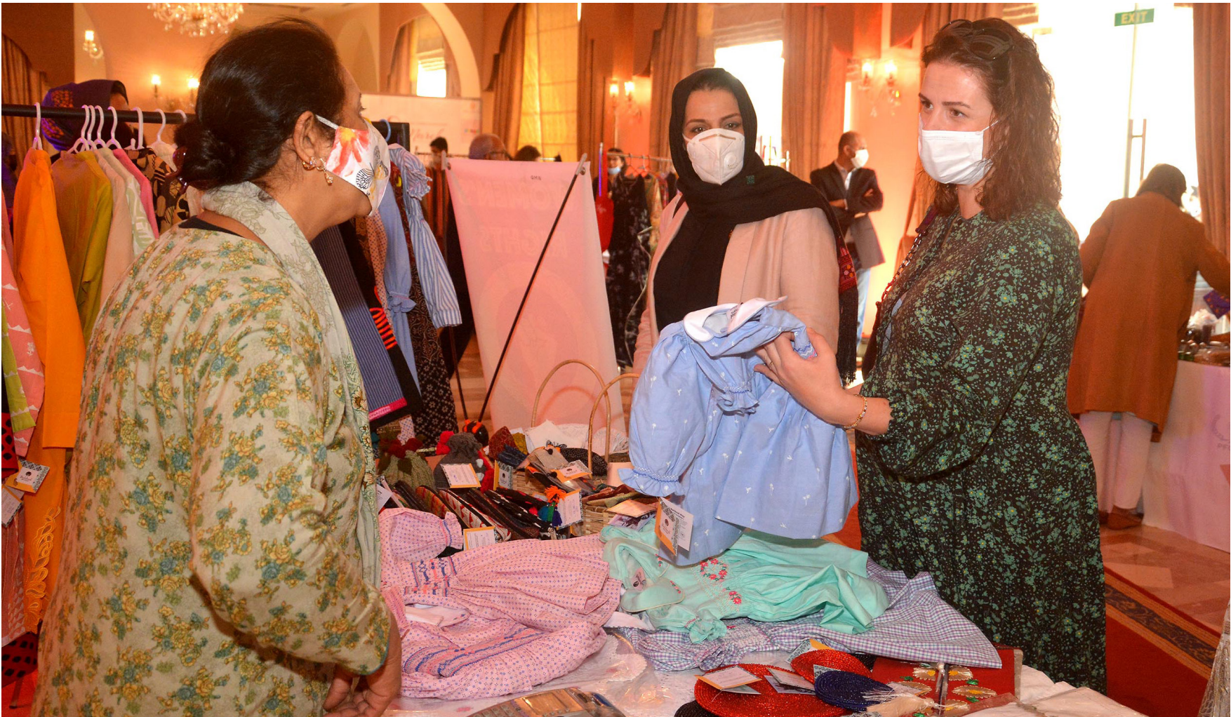
ISLAMABAD: Wives of the Italian and Palestine ambassadors taking interest in various items displayed on the occasion of International Women Day at Islamabad Serena Hotel.