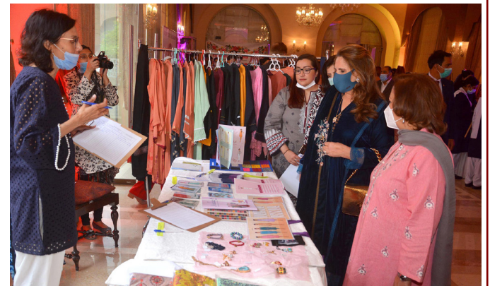
ISLAMABAD: First Lady Mrs. Samina Alvi taking interest in a stall on the occasion of International Women Day celebrations, at Islamabad Serena Hotel.