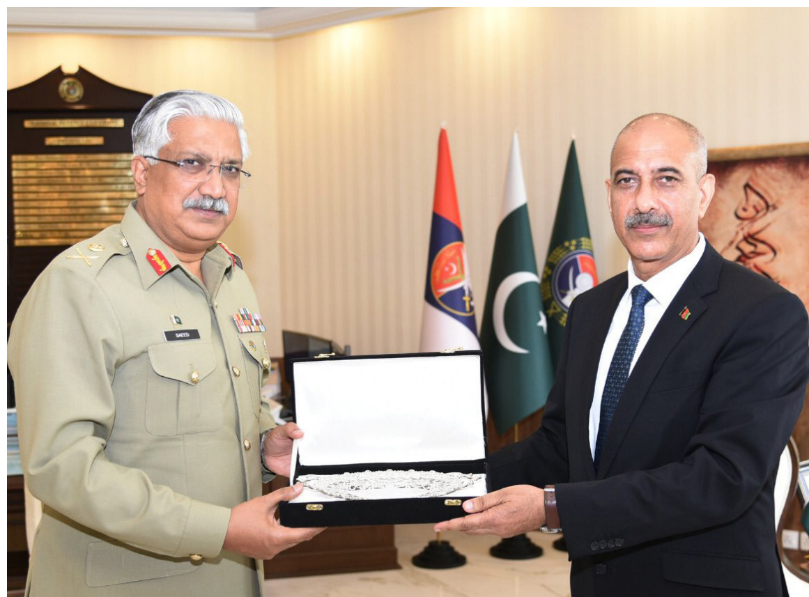
ISLAMABAD: Afghan ambassador to Pakistan Najibullah Alikhil delivered a lecture on Afg-Pak relations: future prospects to former parliamentarians and generals, civil &amp; military representatives, organized by the National Defense University of Islamabad. – DNA

ing information Border Patrol agents can share with media. Citing officials who spoke anonymously, NBC said the new restrictions have been passed down verbally, not through an official memo, what the border patrol agents reportedly call an unofficial "gag order." "The only way to end the Biden Border Crisis is for them to admit their total failure and adopt the profoundly effective, proven Trump policies," Trump said, urging the new administration to complete his signature border wall. – DNA