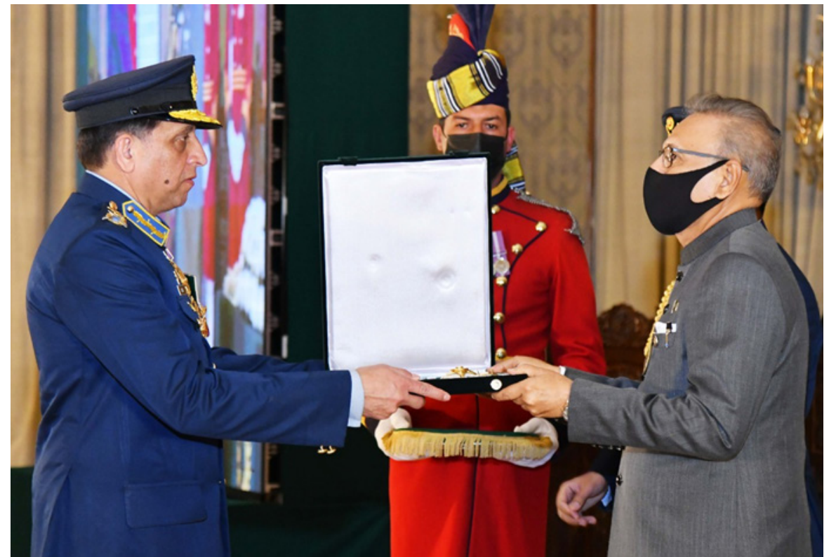
ISLAMABAD: President Dr Arif Alvi conferring the Award of Nishan-e-Imtiaz (Military) upon Chief of Air Staff, Air Chief Marshal, Zaheer Ahmad Babar, at a special investiture ceremony held, at Aiwan-e-Sadr.

ISLAMABAD: Pakistan will receive the fourth shipment of a Chinese COVID-19 vaccine this month. The sources said the shipment containing 60,000 doses of CanSino Biologics COVID-19 vaccine will arrive in Islamabad on March 26 while the fifth batch of the vaccine will reach the country on March 31. They said the government has asked China for shipment of one million doses. So far, Pakistan has received three shipments of Sinopharm vaccine as Beijing has donated 1.5 million doses to Islamabad.