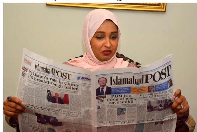
ISLAMABAD: Ambassador of Somalia Khadija Almakzoumi reading Daily Islamabad POST

presence in a few countries alone - thirteen missions to cover 54 countries (the rest are managed through concurrent accreditation). Apart from Africa being a huge potential market for Pakistani goods, the country's geo-strategic location and connectivity offers opportunity for African goods to reach Central Asia and South Asia. 'As Somali Ambassador to Pakistan, I consider my role is to facilitate the contacts between the players in the economic field, to get them to know each other better and also to interconnect in a better way'. She further said, in 1969, Pakistan and Somalia were among the founding members of the Organization of Islamic Cooperation (OIC). Somalia's relations with Pakistan remained strong in the following years and through the ensuing civil war period, when the Pakistani military contributed to a UN peacekeeping operation in southern Somalia. She stressed to further intensify trade and economic relations between the two countries adding she had already interacted with various chambers of commerce and industry in Pakistan with a view to exploring more and more avenues of cooperation.