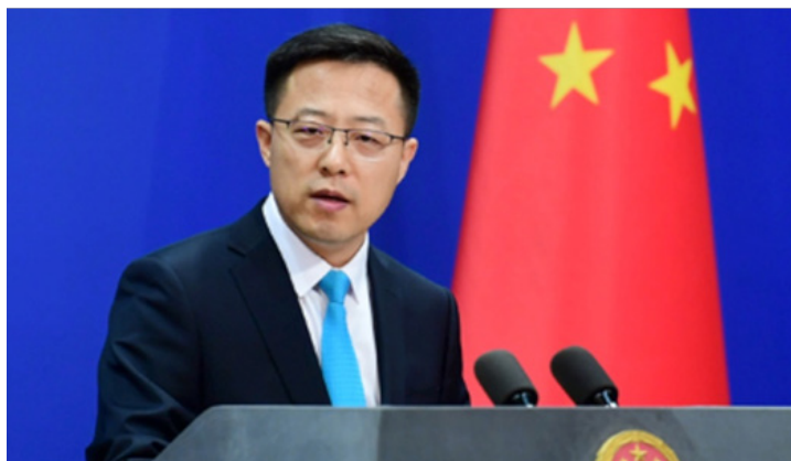
He said the CPEC is an important pilot programme under the BRI and added, "It is an open initiative, based on the principles of joint consultation, shared contribution and shared benefits." "We hope relevant countries and international organisations can

BEIJING: China and Pakistan welcome any initiative that supports the Belt and Road Initiative (BRI) launched by President Xi Jinping and its flagship projects - the China-Pakistan Economic Corridor (CPEC), Chinese Foreign Ministry Spokesperson, Zhao Lijian said on Friday. "China and Pakistan welcome any initiative that supports the BRI and CPEC," he said in his regular briefing in response a question about recent meeting in which Pakistan urged ASEAN members' countries to promote CPEC.