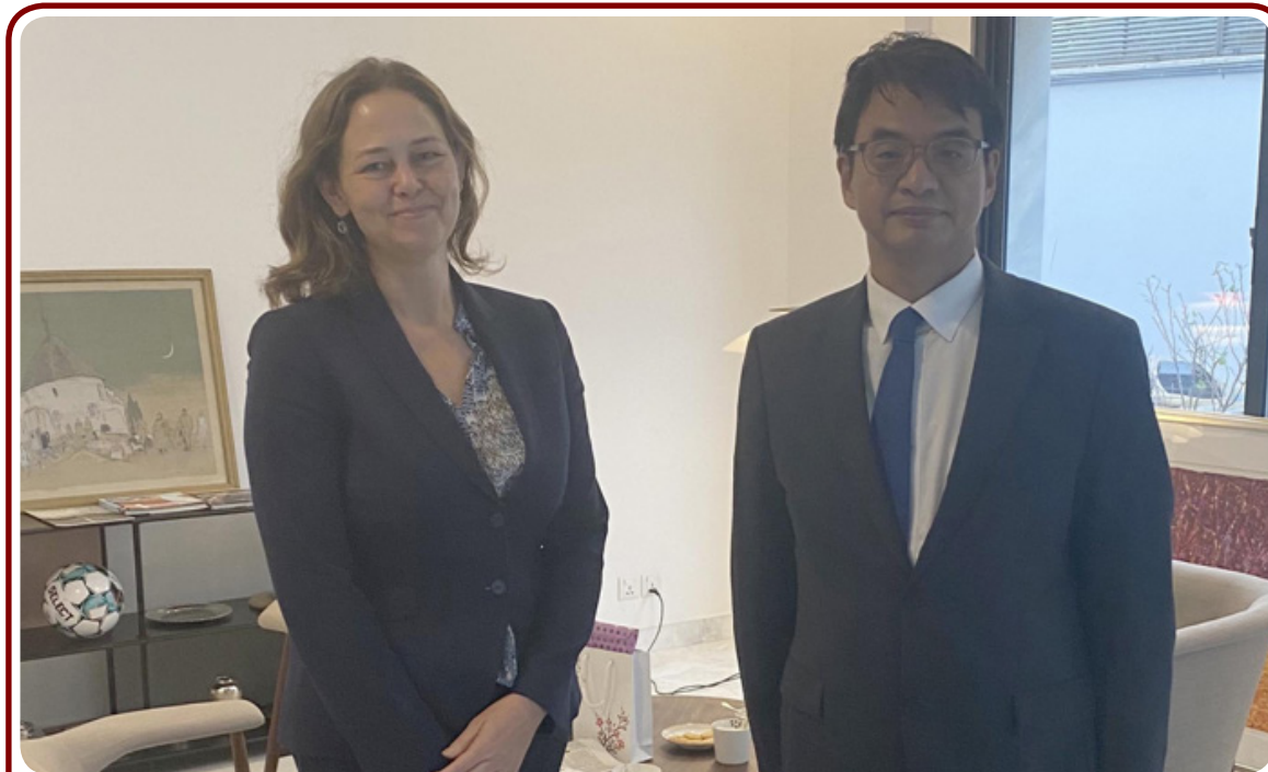
ISLAMABAD: Ambassador Denmark Lis Rosenholm meeting with South Korean ambassador Suh Sangpyo in Islamabad. They discussed the strong collaboration between South Korea on green transition and climate change.

eration in adhering to the SOPs. We can save precious lives including those of our near and dear ones by taking preventive measures." He urged citizens to wear mask, maintain social distance, wash hands with soap frequently and avoid crowded places. He asked the provincial and district governments to enforce necessary preventing measures at public places and encouraging people to protect themselves and others from the virus by adhering to the SOPs.