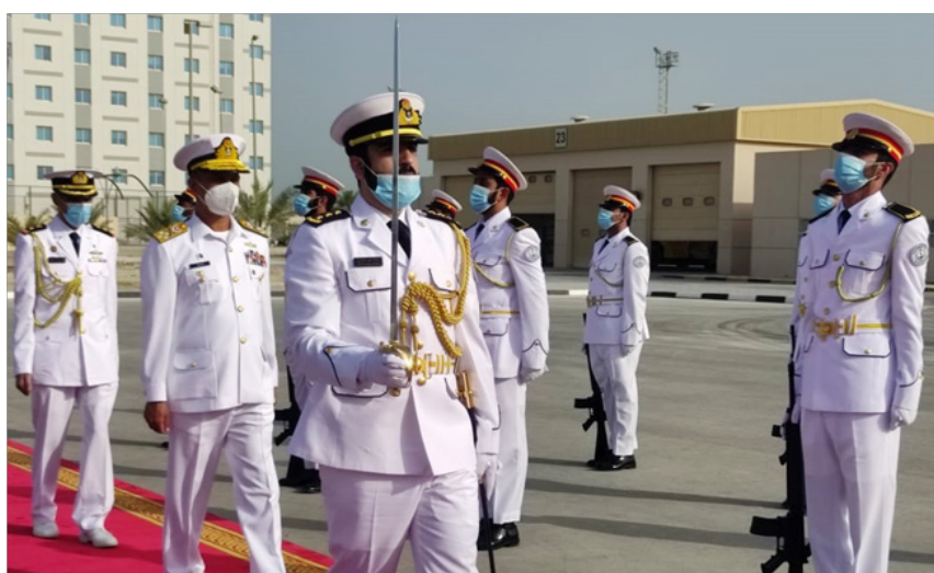
acknowledged Pakistan Navy's efforts and commitment in support of collaborative maritime security and appreciated successful conduct of Exercise AMAN-21.

During call on with Commander UAE Naval Forces, matters of bilateral naval collaboration and regional maritime security were discussed. The Naval Chief underscored Pakistan Navy's initiative for ensuring maritime security in the region through Regional Maritime Security Patrols (RMSP) and participation in Combined Maritime Force. The Naval Chief also thanked Commander UAE Naval Forces for participation in Multinational Maritime Exercise AMAN-21. Commander UAE Naval Forces