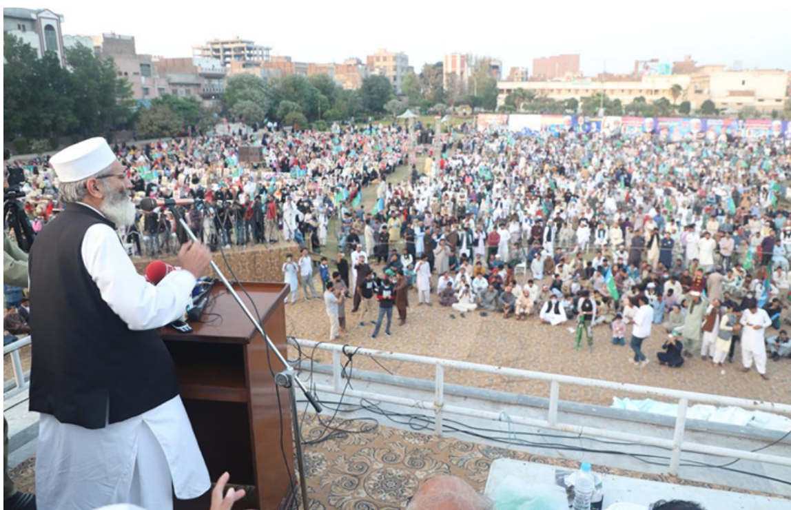
FAISALABAD: Ameer Jamaat e Islami Siraj ul Haq addressing to public gathering at Dhoobi Ghat Ground.

travelled on the Orange Line Metro Train project since its inauguration on October 26, 2020. This shows how local residents have embraced this project with utmost excitement and have made it a part of their daily lives. Thousands of commuters are benefiting from this safe, fast and economical mode of transportation which is also benefiting the environment.