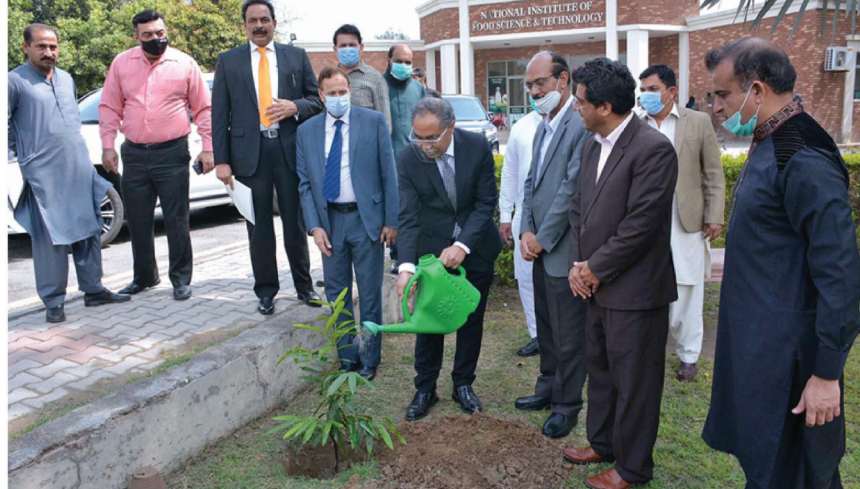
both countries. Talking about the UAF, he said the UAF was listed among the top ranked universities across the globe in the agricultural sector and making marvelous contributions in academia and research. Talking about

that Indonesia was exporting palm oil to Pakistan. He said palm oil production was important to economy of Indonesia as the country was one of the biggest producers of palm oil. Talking about academia ties, he said that they would open up new avenue of the academia exchange, including bilateral seminar, conferences among the UAF and his country's educational institutes particular in agriculture, livestock and animal sciences. Besides, he also urged students and faculty to apply for KNS fully funded scholarship 2021 to study in Indonesia. He said there were many similarities in the culture of the