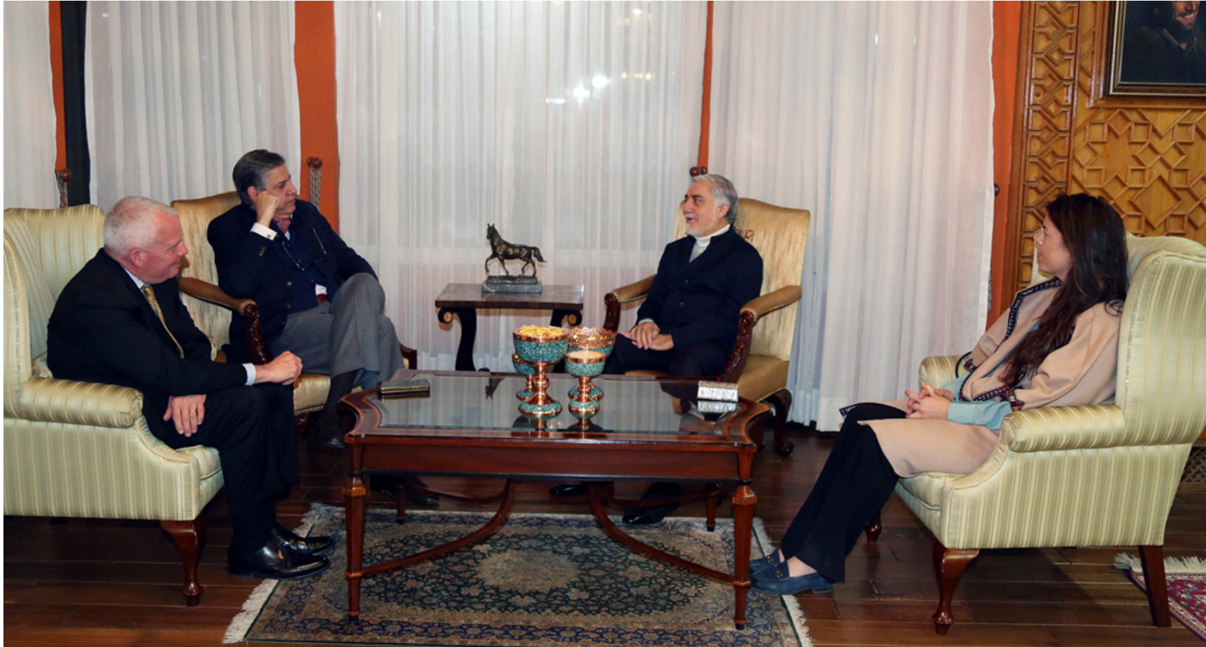
KABUL: Dr. Abdullah Abdullah meeting with Ambassador Stefano Pontecorvo. They discussed issues related to Afghan peace etc.

In a statement the ADB said that it remains "deeply concerned about recent developments in Myanmar, especially the loss of life during civil protests." The bank stated that the change in the country's circumstances will have a serious impact on Myanmar's economic and social development. The bank has put "a temporary hold on sovereign project disbursements and new contracts in Myanmar", while the international community assesses the evolving situation.