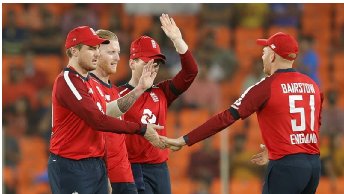
AHMEDABAD: English players celebrating after taking wicket in 1st T-20 match against India.

But no causal relationship had been established between the shot and the health problems reported, she said. Bulgaria's decision to pause its rollout follows similar steps by Denmark, Iceland and Norway as well as Thailand. Italy and Austria have stopped using certain batches of the drug as a precautionary measure. "I order a halt in vaccinations with the AstraZeneca vaccine until the European Medicines Agency dismisses all doubts about its safety," Bulgarian Prime Minister Boyko Borisov said.