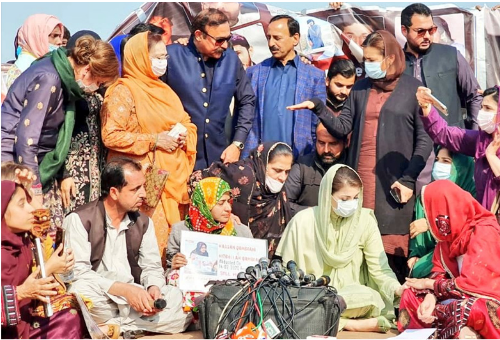
ISLAMABAD: PML N Vice President Maryam Nawaz visits families of disappeared persons, at D Chowk on Wednesday.

The convener, who also holds portfolio of Commissioner for Children and Transgender at Wafaqi Mohtasib, said amendments in procedural laws were also proposed, aimed at authorizing the Federal Investigation Agency or police to take cognizance of the offence (especially dissemination of pornographic material on social media, CDs, etc.) regardless of the complaint made by the aggrieved) on its own; and / or if the case is referred to it by any agency, person and others. She said a draft of the proposed amendments would be presented in next meeting of the task force to get its final approval. Once approved, it would be forwarded to the quarters concerned for further necessary action. - APP