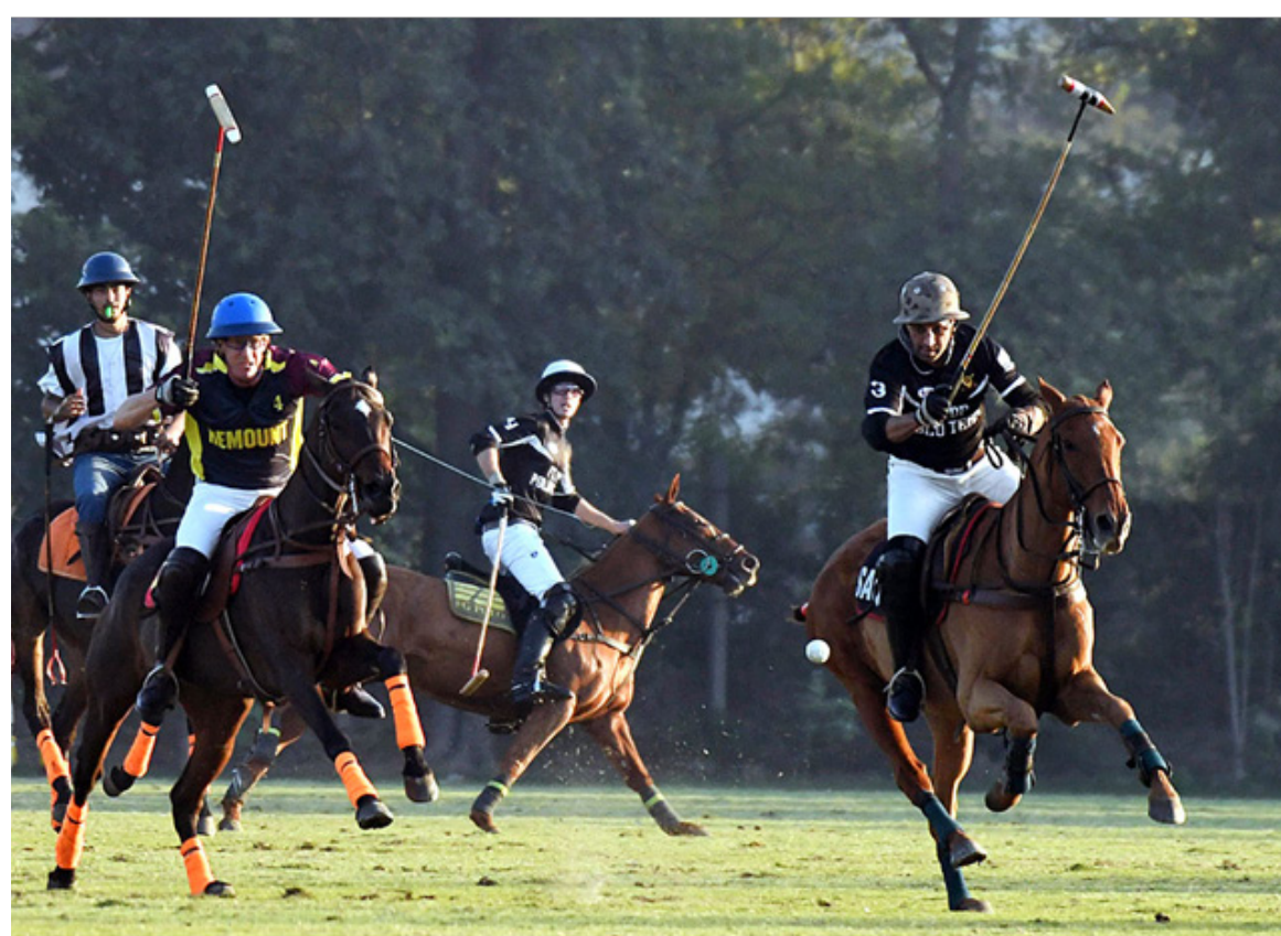
Lahore: Players struggling to get hold on the ball during 2nd semifinal between Diamond Paints FG Polo and Remounts polo teams played at Aibak Ground Polo Club as part of Happy Cow Polo for Peace-II for Pakistan Polo Cup 2020.

to sound the alarm as the virus continues to spread throughout the country, an upward trend they fear could overwhelm the health care system and prevent hospitals from providing basic medical treatment. A sustained increase in new infections has already forced officials to roll back or suspend campaigns intended to reboot the economy through subsidies to the tourism and food industries. Hokkaido was the first prefecture in Japan to declare a state of emergency — though it didn't have a legal basis to do so — in late February, weeks before the central government declared an emergency in seven prefectures in early April. The order was extended nationwide 10 days later and lifted completely on May 25.