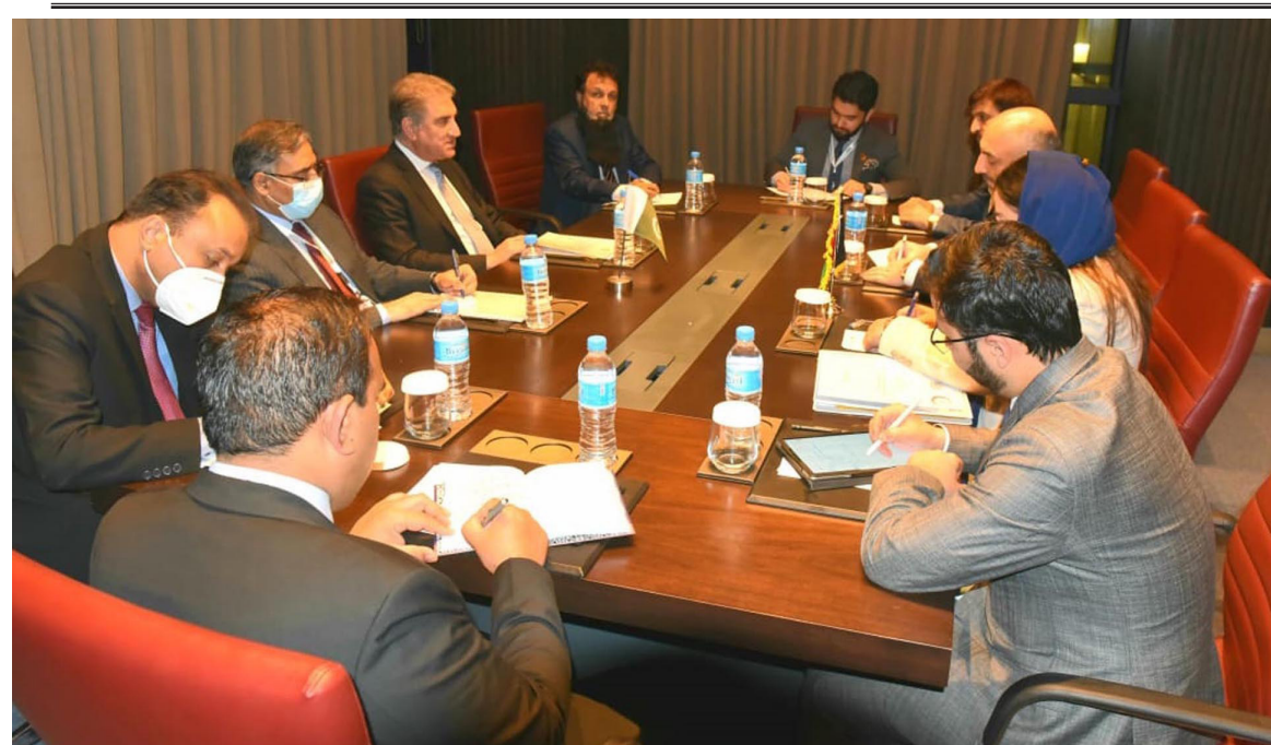
NIAMEY: Foreign Minister Shah Mahmood Qureshi meeting with Foreign Minister of Afghanistan Haneef Atmar on the sidelines of the 47th session of OIC Council of Foreign Ministers.

KARACHI: The novel coronavirus claimed 12 more lives and infected as many as 1,423 people during the past 24 hours in Sindh. In a statement on the daily COVID-19 situation in the province, Sindh Chief Minister Syed Murad Ali Shah said that 12 more people died from the coronavirus during the past 24 hours, taking the death toll from the disease to 2,897 in the province. He maintained that 12,226 samples have been tested in 24 hours that detected 1,423 new COVID-19 cases in the province. The chief minister said that 1,157 new coronavirus cases emerged overnight only in Karachi. Earlier on November 26, Sindh had reported 1402 new cases of coronavirus and 19 deaths by the Covid-19 pandemic in the province in the last 24 hours, according to Chief Minister Murad Ali Shah. "Sindh reported 1402 new cases when 10,585 tests were performed during 24 hours," CM Sindh Syed Murad Ali Shah said, in a statement on the situation of the pandemic in the province.