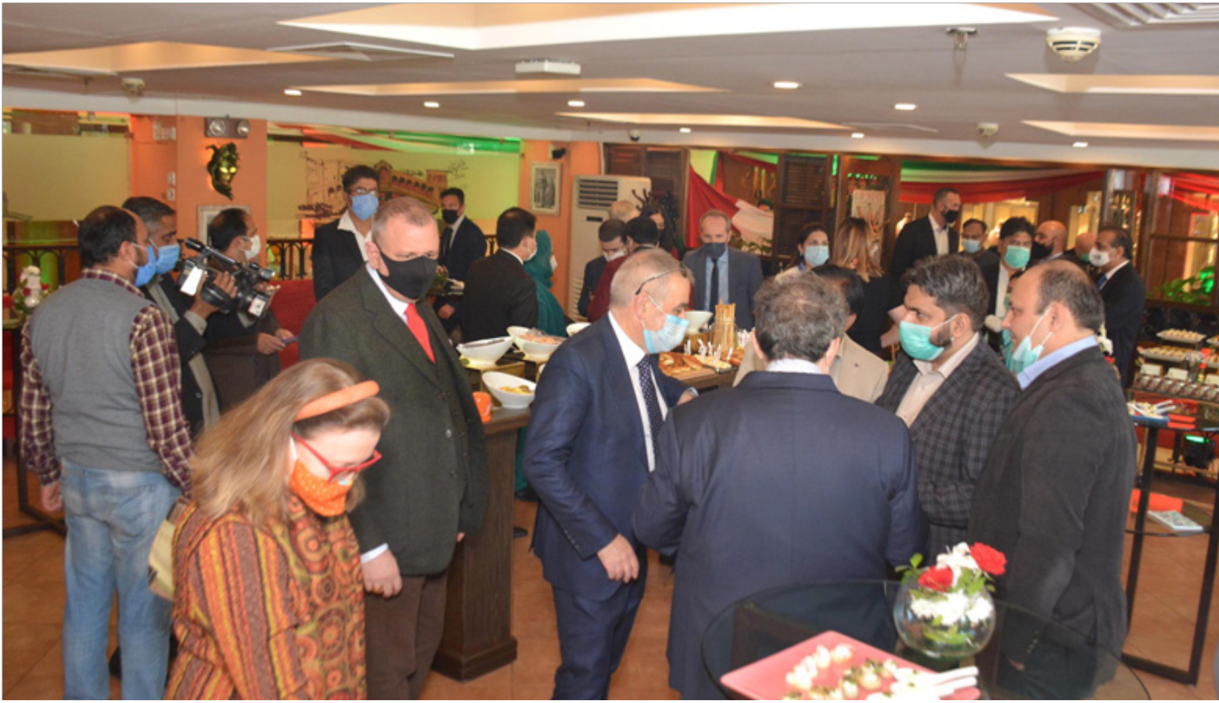
ISLAMABAD; Guest enjoying Italian cuisines during Italian Food Day at Islamabad Marriott Hotel.