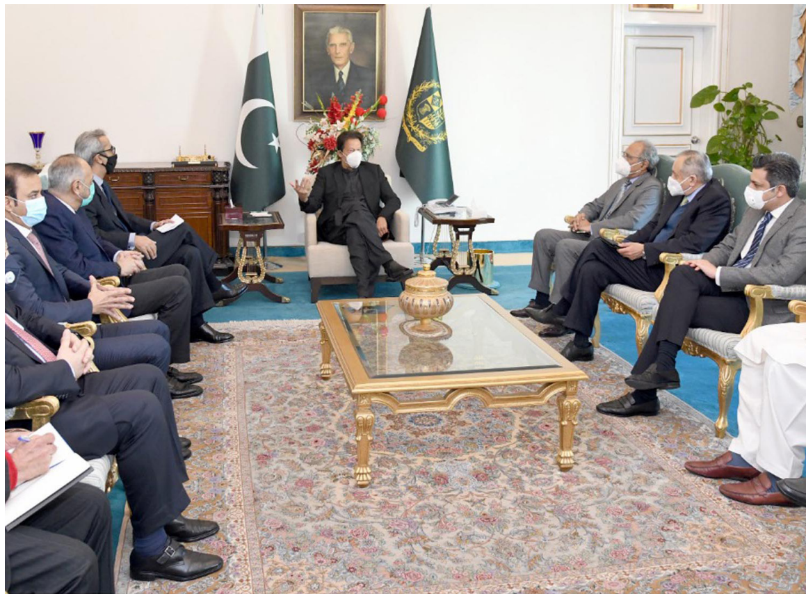
ISLAMABAD: A delegation of leading businessmen met with Prime Minister Imran Khan in Islamabad.

has been started. In this regard, Rs 96 million were approved few months back for establishing gas supply network in Park enclave 1. On the other hand the developmental work and restoration of infrastructure in Park enclave 2 is also underway. The survey work of the project has been completed whereas the earthwork of roads and streets is underway. The survey for tube wells to meet the facility of water has also been completed. The developmental work in Park Enclave 3 is also underway. The PC1 of the project has also been approved.