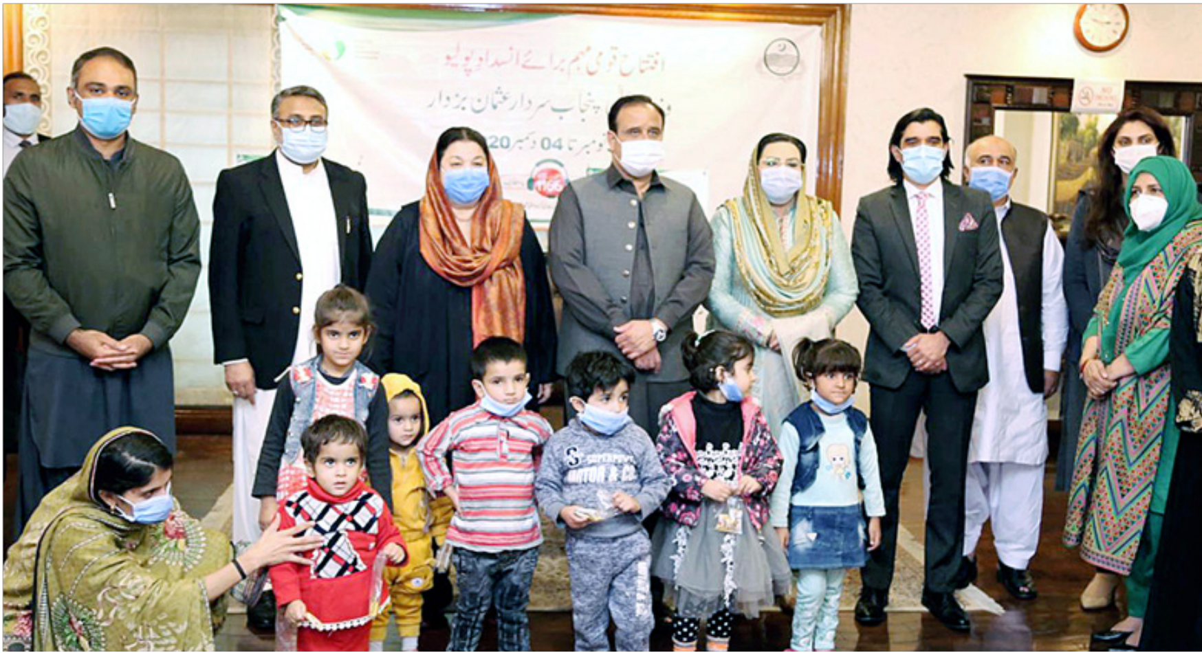
LAHORE: Punjab Chief Minister Sardar Usman Buzdar in a group photo with children in CM office during anti-polio campaign.