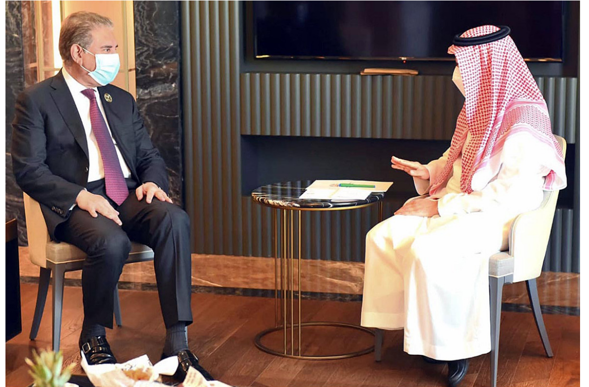
NIAMEY: Foreign Minister Makhdoom Shah Mahmood Qureshi had a bilateral meeting with Saudi Counterpart Faisal Bin Farhan Al Saud on the sidelines of the 47th CFM session in Niger.