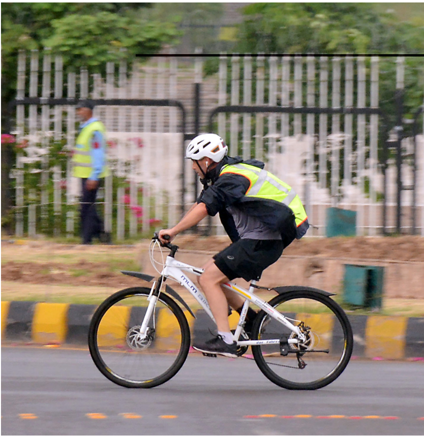
ISLAMABAD: A foreign citizen cycling during a pleasant weather in federal capital.

within a period of 90 days. A reference has been sent to National Accountability Bureau (NAB) to investigate the misappropriation in subsidies given to sugar mills according to NAB ordinance 1999. The Competition Commission of Pakistan (CCP) would probe last 10 years cartelisation in sugar industry, State Bank of Pakistan will investigate sugar mills wilful loan defaults, pledged sugar stocks according to their rules. FIA will inquire the fake export of sugar to Afghanistan and report within 90 days period. Provincial governments have been asked to probe violations by sugar mills including paying less price of sugarcane to farmers and other violations.