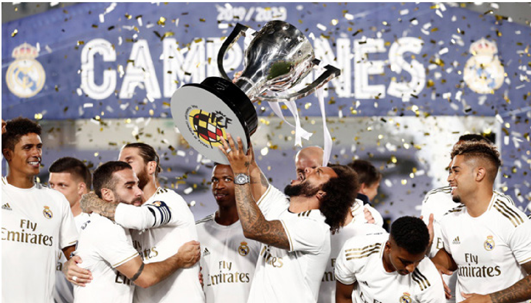
MADRID: Real Madrid C.F. players celebrating with the trophy as they are crowned La Liga champions for a record 34th time.