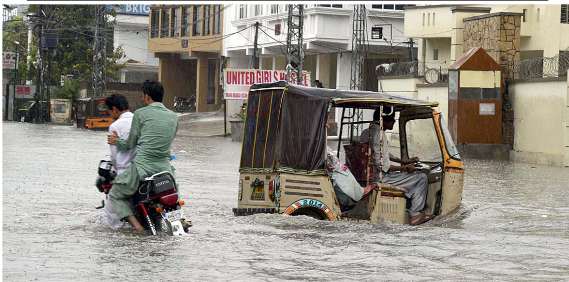
RAWALPINDI: An auto rickshaw and motorcycle passing through rain water accumulated at Commercial Market Road during rain in the Twin Cities. — APP

The competence and capabilities in relevant areas of space science and technology for space exploration could help attain sustainable socio-economic development and improve the quality of life of the people of Pakistan, he said, adding that, the incumbent government was working on many fields at the same time. The efforts of the government would change the destiny of people of Pakistan, he assured. — APP