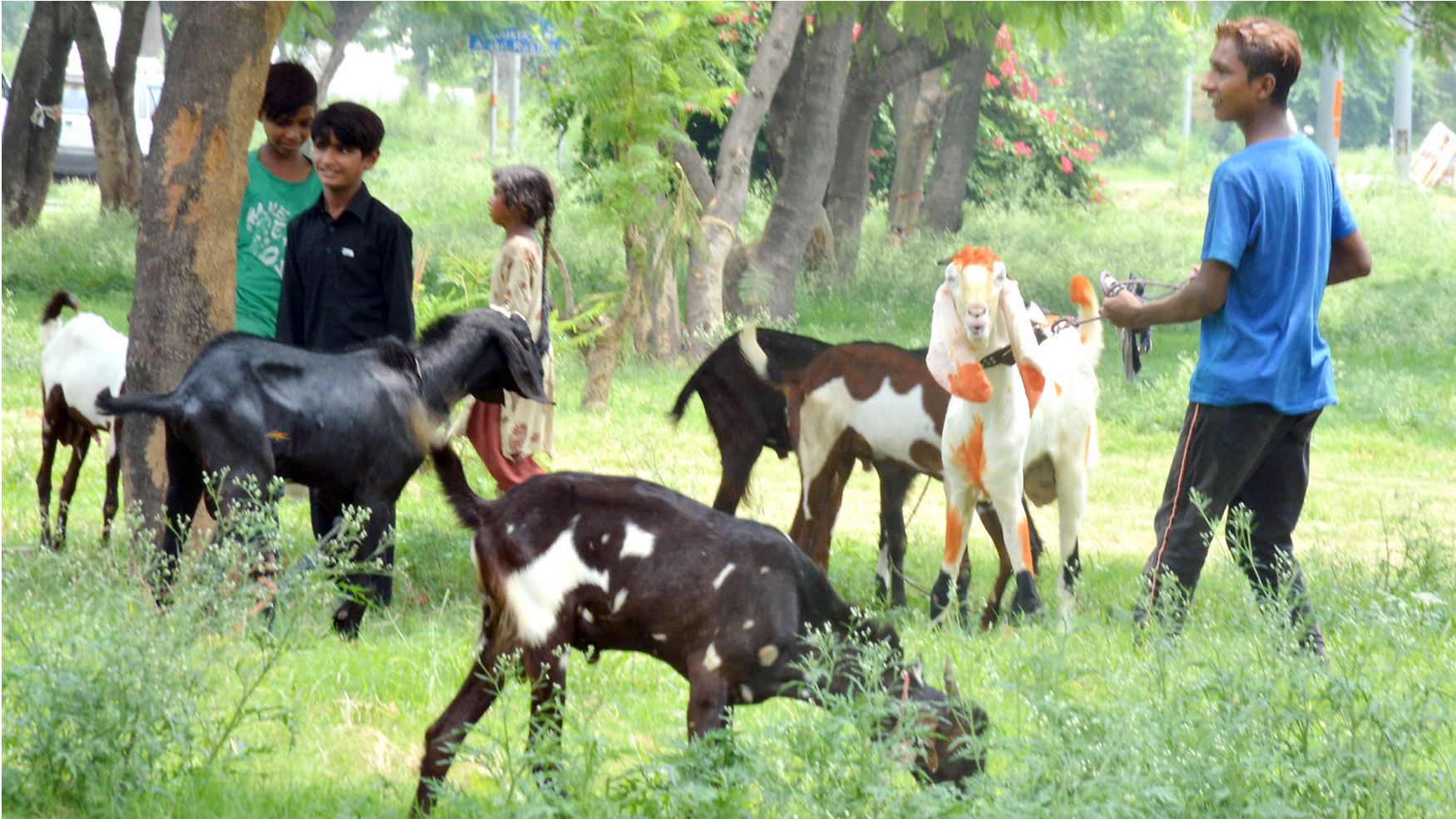
ISLAMABAD: Children enjoying outdoor time with sacrificial animals in capital greenery ahead of Eid. – DNA

ISLAMABAD: Pakistan Post has decided to expand its Counter Automation System to all 83 General Post Office (GPOs). “Counter Automation System aims at computerizing the Post Office counter” an official of Pakistan Post told APP on Friday. He said that “it provides state-of-the-art point of sale terminals which can handle all the counter”. He said that Pakistan Post intended to offer collaboration with interested e-commerce partners, through selling their products using postal counters, by providing brochures or using tabloids for order placement on online Pak post shop. Pak Post was offering collect and return services for the exchange and return of articles through postal counters, he added. – APP