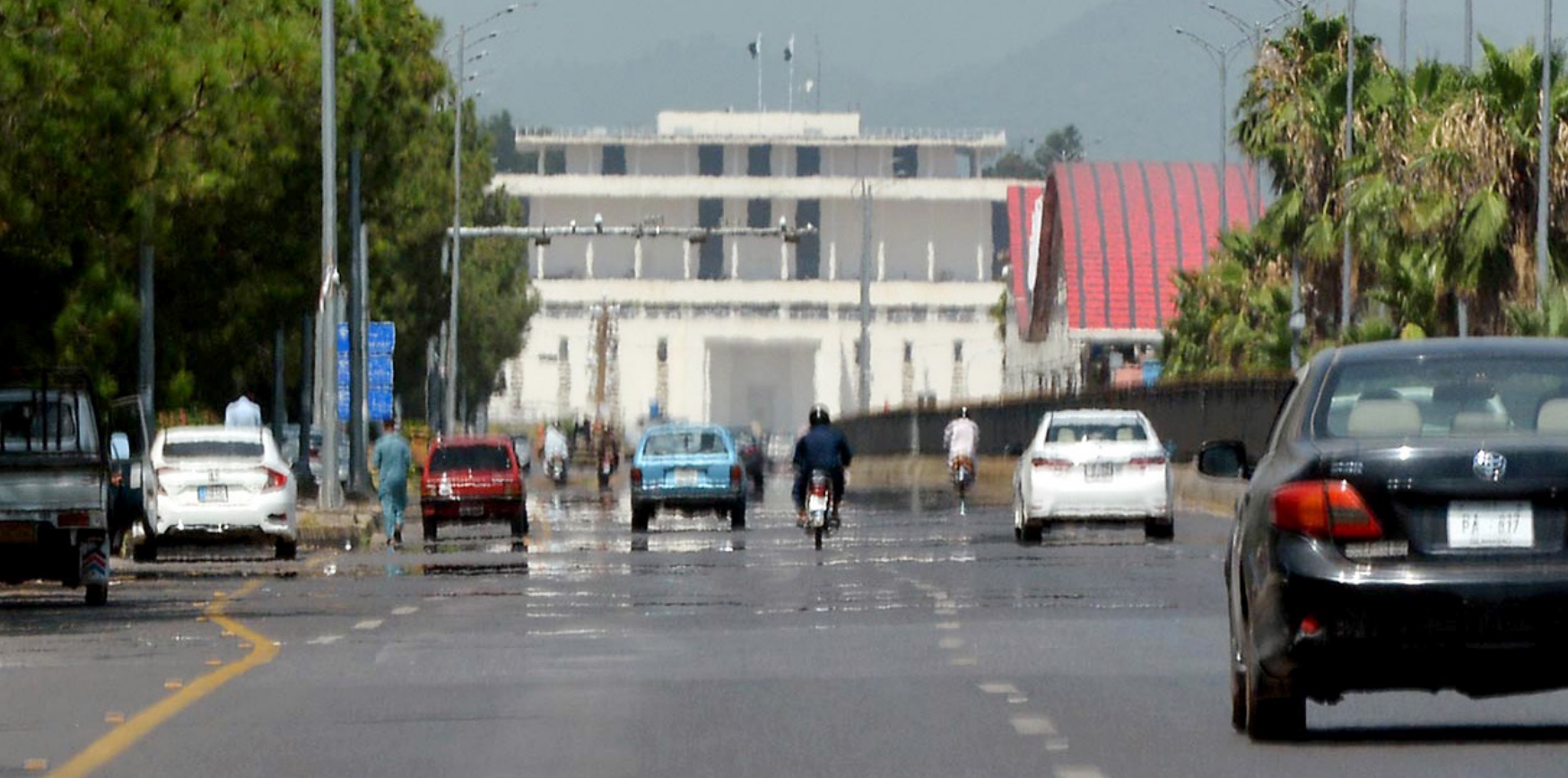
ISLAMABAD: A view of mirage on road due to scorching hot weather in Federal Capital. – DNA

ISLAMABAD: The Islamabad Electric Supply Company (IESCO) on Thursday issued a power suspension programme for Friday for various areas of its region due to necessary maintenance and routine development work. According to IESCO Spokesman, the power supply of different feeders and grid stations would remain suspended for the period from 04:40am to 09:40am, Sagri, HPT2 feeders 05:00am to 10:00am, Mandra-I, Mandra-II feeder, 07:00am to 11:00am, Madu Kalas feeder and surrounding areas. – APP