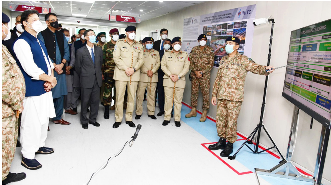
ISLAMABAD: Prime Minister Imran Khan visits E ICU isolation hospital and infections treatment centre.

ed in the country, but now after obtaining permissions the PIA would operate regular flights for the convenience of passengers. The PIA said the passengers could book and purchase their tickets through PIA offices, corporate website and its travel agents. However, the passengers would be required to get their Covid-19 tests done within 48 hours prior to flight departure and a negative test report would have to be presented at the time of check-in.