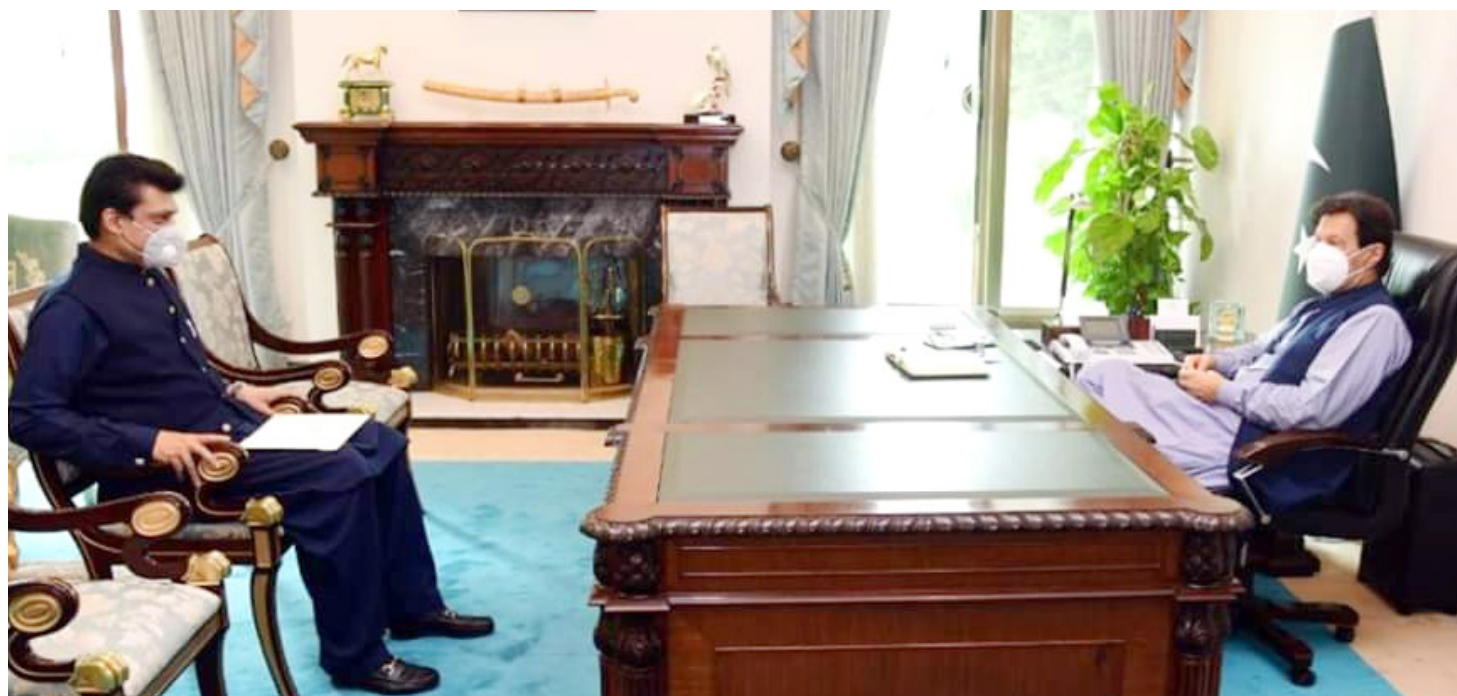
ISLAMABAD: Leader of the House in Senate Shahzad Waseem meets Prime Minister Imran Khan.

ISLAMABAD: Sardar Masood Khan, President Azad Jammu and Kashmir, has said that because of US's protection to India in the UNSC, the latter is operating with absolute impunity in the Indian Occupied Jammu and Kashmir (IOJK). This is where, he said, realpolitik is steering dynamics of the Kashmir dispute. Both the US and India have economic and defence partnerships, and this has become a barrier for the US, as it sees the Kashmir dispute through the prism of India, he said. The AJK President made these remarks while addressing a virtual conference of club members, belonging to different walks of life, of a prestigious IVY League institute. The address was followed by a comprehensive Q&A session. In his introductory remarks, the President while explaining the genesis of the Kashmir issue said that in 1947, the people of Jammu of Kashmir had to choose either to accede to Pakistan or India.