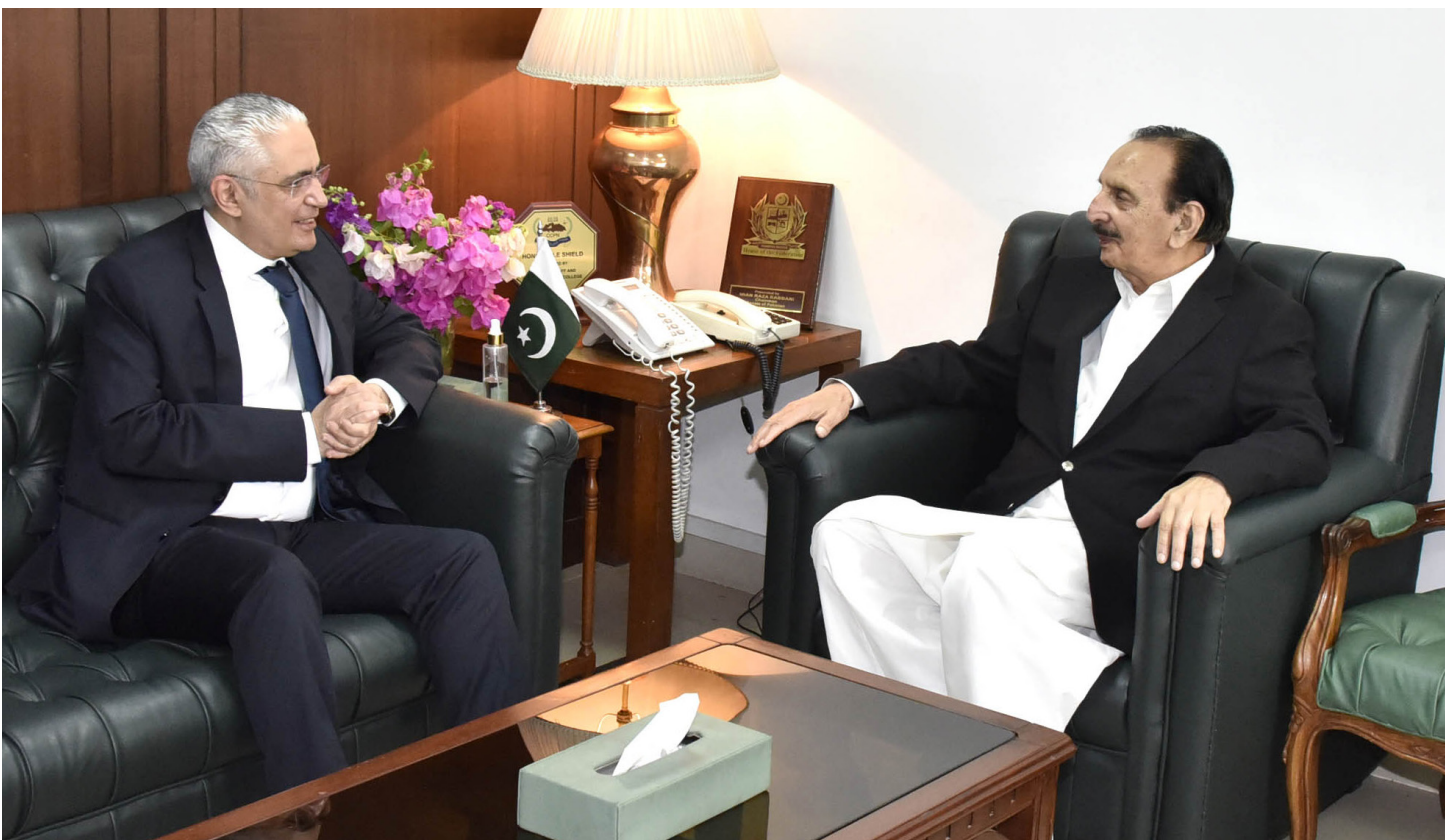
ISLAMABAD: Senator Raja Muhammad Zafar ul Haq, leader of the opposition in Senate, exchanging views with Egyptian Ambassador Tarek Dahroug at parliament house.