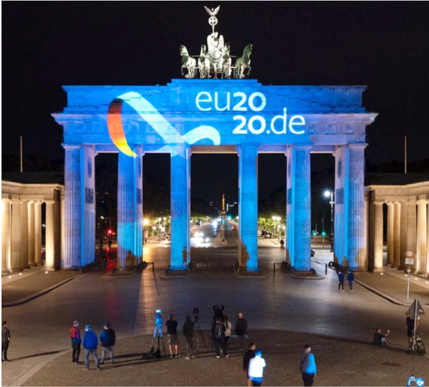
BERLIN: Germany has taken over the rotating EU presidency for next six months.