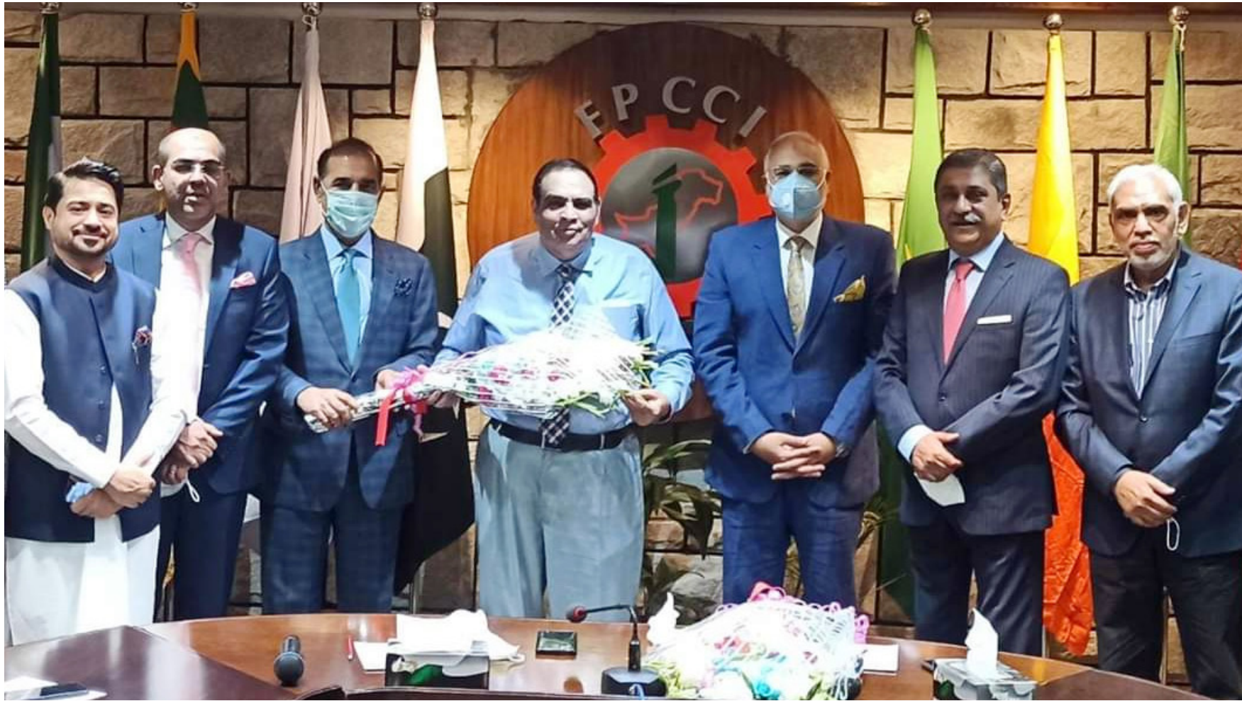
ISLAMABAD: Members of Rawalpindi Chamber of Commerce and Industry presenting bouquet to newly elected President of SAARC CCI.

The concerned department had already directed to complete dredging Leh Nullah before monsoon season, he said. Directives were also issued for dams operation of Mangla and Tarbela in the monsoon seasons under the set rules and regulations, he said. The Chairman said Pakistan Space and Upper Atmosphere Research Commission (SUPARCO) was also requested to share weather and climatic details. There were 10 per cent above normal prediction of rains for AJK and Sindh in the monsoon season, he said. He said it was the responsibility of FFC to implement flood protection plan. SOPs have already made for dams which were reviewed regularly by FFC, he said. — APP