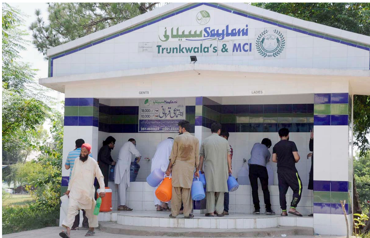
ISLAMABAD: A large number of residents of I-9 Sector busy in filling their pots with drinking water from filtration plant.

ary award in 2017. Almost 70 per cent of the area of Sector G 14/3 has been got vacated and development work is being executed on the site. It further stated, the measurements for BUP are being conducted in Sector G 14/2 and award of BUPs in G 14/2 was done in February 2020. Similarly measurements for BUP have already started in G 14/1 and award of BUPs is expected by 31 March 2020. Earlier, FGEHF had decided to accommodate settlers of G 14/1 to G 15 and a summary in this connection was forwarded to the concerned authorities for approval. Many people who were allotted plots in this particular sector have died while majority of the allottees has sold out plots because they had lost hopes of early development of this sector.