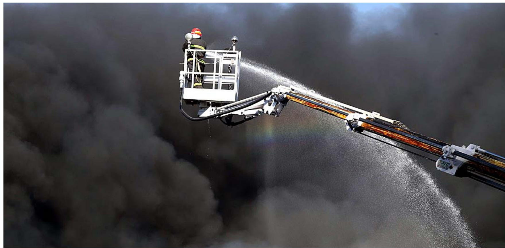
RAWALPINDI: Firefighters struggling to extinguish fire as more than 1000 firefighters struggling to extinguish the massive fire that broke out yesterday afternoon at Dalda Cooking Oil and Ghee Mill, located in the area of Kalyam Shareef.

ISLAMABAD: Senior leader of Pakistan Tehreek-e-Insaf Sadaqat Ali Abbasi Wednesday said that the federal government was utilizing all available resources to increase testing capacity for COVID-19 from 25,000 to 30,000 per day and taking multiple steps to contain the further spread of coronavirus in the country. Talking to a private news channel, he said the challenge of COVID-19 was not only the issue of Pakistan but the entire world was dealing with this pandemic and the revival of economy was topmost priority of the government. "Pakistan's testing capacity was limited when the first case was reported in the country but with each passing day, it was increasing," he said. - APP