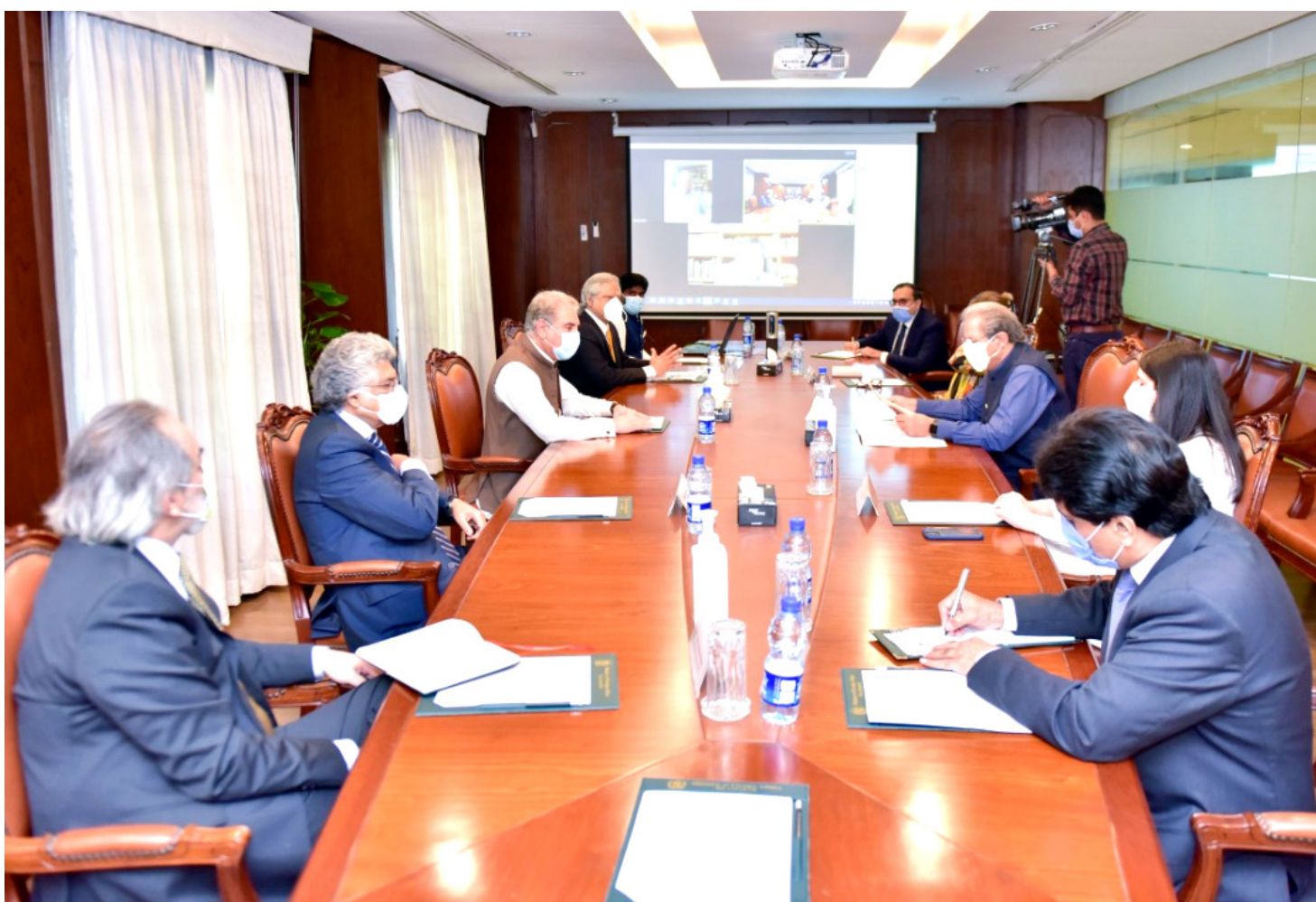
ISLAMABAD: Foreign Minister Shah Mahmood Qureshi and others taking part in a meeting to discuss public diplomacy initiatives.

UNITED NATIONS: Nearly 50 UN human rights experts have condemned Israel's plan to annex parts of the occupied West Bank, calling it a "vision of a 21st Century apartheid". Such a move would violate international law and leave what would amount to "a Palestinian Bantustan", they warned in a joint statement. The forty-seven of the independent Special Procedures mandates appointed by the Geneva-based Human Rights Council, who signed the statement, said such move by Israel "must be meaningfully opposed by the international community". "The annexation of occupied territory is a serious violation of the Charter of the United Nations and the Geneva Conventions".