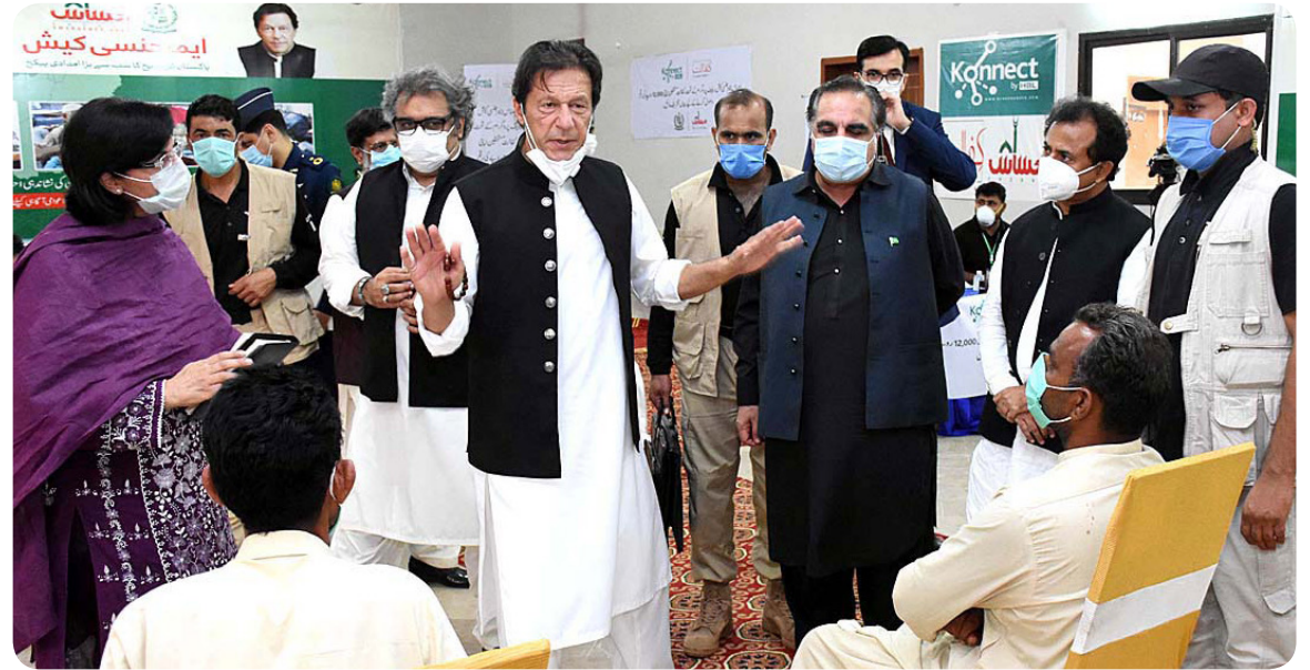
LARKANA: Prime Minister Imran Khan interacting with beneficiaries during his visit to Ehsaas Centre setup at Police Training Centre. Governor Sindh Imran Ismail, Minister for Maritime Affairs Syed Ali Zaidi and PM's Special Assistant Dr Sania Nishtar accompanied the prime minister.

It is learnt that the coronavirus vaccine may appear on the market at the end of 2020 or the beginning of 2021, according to SASAC. The workshop has been making the final preparation for the production of the vaccine since May 30, 2020. China National Biotec Group belongs to China National Pharmaceutical Group Co., Ltd. (Sinopharm), a large healthcare group. Sinopharm has a full chain in the industry covering R&D, manufacturing, logistics and distribution, retail chains, healthcare, engineering services, exhibitions and conferences, international business and financial services, the report added.