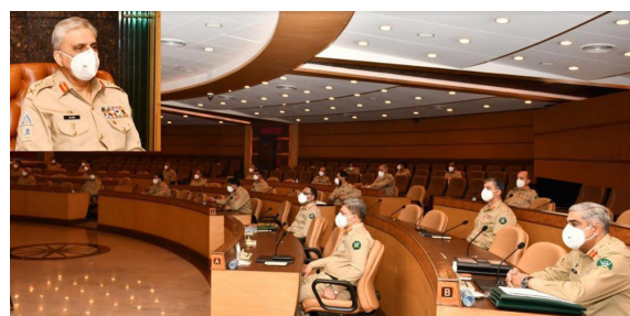
Noting the Indian aggression, forum resolved to continue thwarting Indian designs and expose Indian targeting of innocent civilians in Kashmir and open support to terrorist outfits. Forum also discussed Army's ongoing support to Government against COVID-19, Locust threat, Polio campaign and ways to improve the same, within available resources.

RAWALPINDI: Corps Commander's Conference was held at GHQ. The forum was briefed on national and regional security situation. Forum expressed satisfaction on continued reduction in incidents of violence across the country, gradual positive effects of ongoing Afghan Peace Process along the Western Border and resolved to keep supporting the normalization process through national institutions.