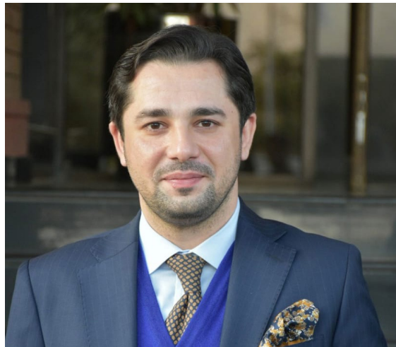
that the government should immediately investigate this matter. Muhammad Ahmed Wa-

tion made in the prices of petroleum products. He said that despite significant cut in POL prices, the government has increased the price of furnace oil from Rs.40,000 per metric tonne to Rs.61,000 per metric tonne within two months which was unjustified. He said that most of the electricity in Pakistan was generated from furnace oil but it was strange that price of furnace oil has been further enhanced despite the record decline in oil prices in the global market. He said that the government has significantly reduced the price of kerosene but the kerosene was being sold in the market up to Rs.140 per litre and urged