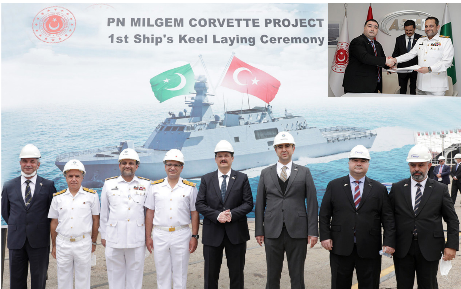
TURKEY: Pakistan Navy and Turkish officials during keel laying ceremony of Pakistan Navy's 1st MILGEM Class CORVETTE at Istanbul Navy Shipyard.

UNITED NATIONS: UN High Commissioner for Human Rights, Michelle Bachelet, has expressed alarm at the clampdown on freedom of expression in India and 11 other countries in the Asia-Pacific region during the coronavirus crisis. In a statement issued in Geneva on Wednesday, she said that any action the authorities take to stop the spread of false information must adhere to the principles of legality, necessity, proportionality, adding that "in these times of great uncertainty", citizens had a right to voice their concerns. – APP