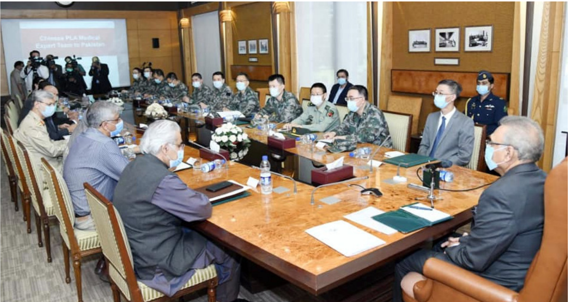
ISLAMABAD: President Dr. Arif Alvi received Chinese medical expert team and highly praised their support & assistance to Pakistan's fighting against COVID-19. Chinese Ambassador Yao Jing also seen in the picture.