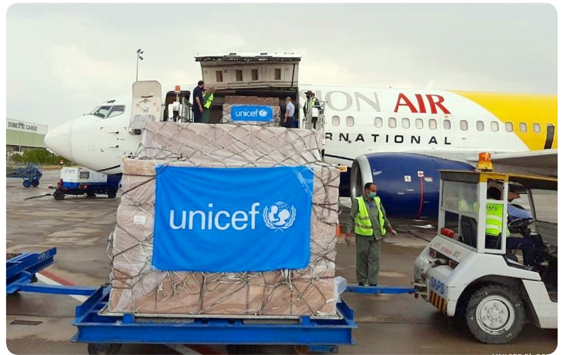
ISLAMABAD: UNICEF procured PPEs for Pakistan government. The equipment arrived on Friday.

the wrong were very clear and the justice always prevailed. "We highly appreciate Pakistan's objective and just position on this issue and we will like to continue to uphold the vision of a community with shared future for mankind, strengthen cooperation with international community including Pakistan and work together to win this fight against the virus," he added. It may be mentioned here that the Senate of Pakistan had unanimously passed a resolution expressing its gratitude to China, led by President Xi Jinping, for its decisive and timely measures to combat novel coronavirus and appreciating China's support to Pakistan in the fight against COVID-19.